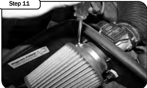
Install filter and tighten clamp using a 5/16 nut driver. Reconnect factory intake hose to MAF sensor. Reconnect MAF sensor and temp sensor harness