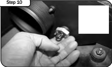
For early model applications, a 3/8 nut is provided to hold threaded temp sensor in place. Newer models are not threaded. A Temp Sens. grommet will be used instead.