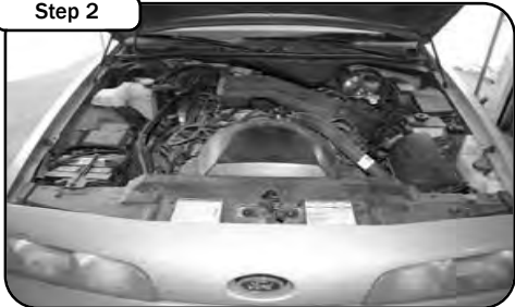
Complete stock intake.