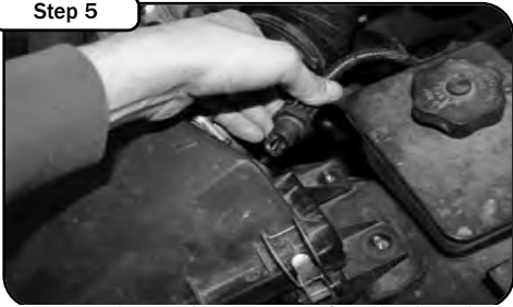
Remove the factory air temp sensor. Set aside for re-installation.