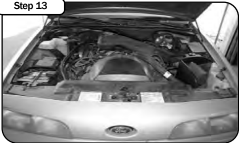
Place enclosed CARB EO sticker on a clean/smooth surface on or near the intake system. Your installation is now complete. Make sure you tighten all clamps/nuts and check all electrical connections. Re check periodically