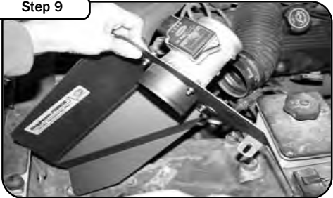
Reinstall new housing with MAF sensor connected.