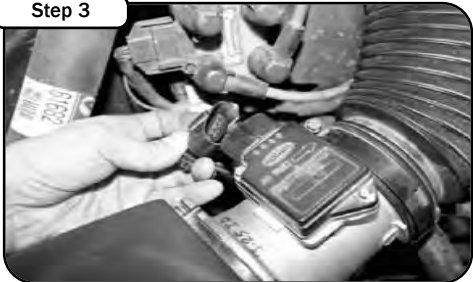
Disconnect MAF sensor. Using 5/16 nut driver, loosen intake hose and disconnect.