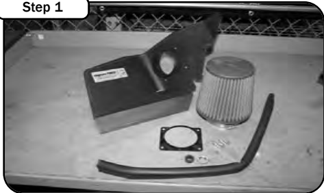
Complete kit. Make sure all components are present prior to beginning installation.