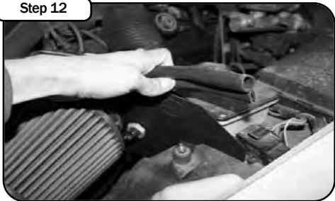
Install 7/16 trim seal provided on new housing.