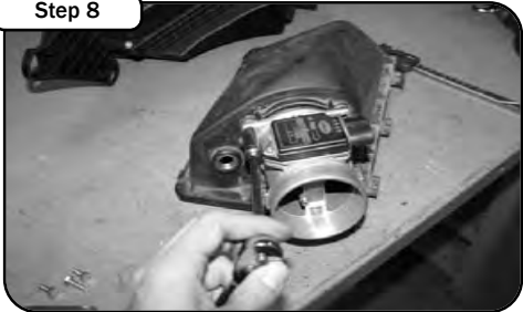
Using a 10mm socket, unscrew the 4 factory screws securing MAF sensor. Disconnect the MAF sensor and transfer onto new housing using new gasket provided.