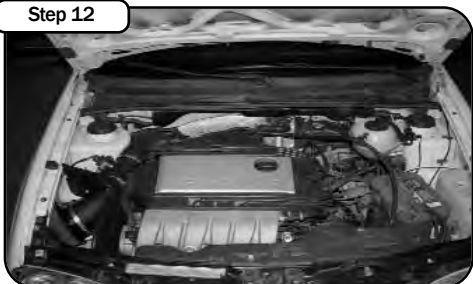
Your installation is now complete .Make sure you tighten all clamps and check all electrical connections. Re check periodically.