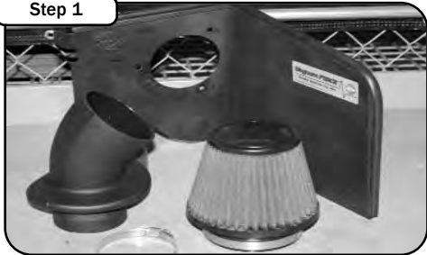
Complete intake system. Verify all parts listed are present prior to beginning installation.