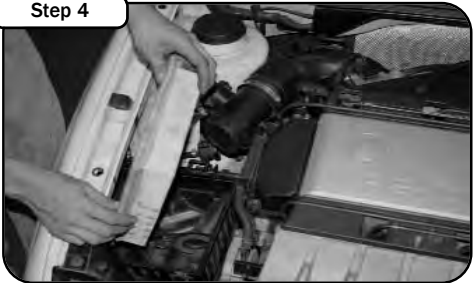
Remove the factory air filter.