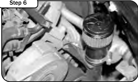
Place the supplied breather air filter on the OE location. Secure with the supplied hose clamp.