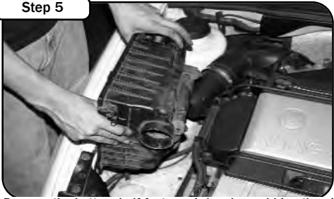
Remove the bottom half factory air box by grabbing the air box by the sides and lift up and out.