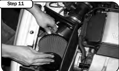
Install the new air filter into the housing secure the filter with the provided clamp. The air filter is pre oiled from the factory.