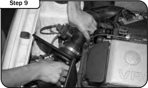
Position the new intake into the engine bay. Slide the MAF unit into the intake tube. Secure with the provided hose clamp.