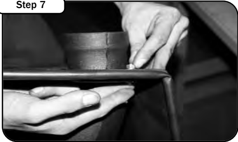
Secure the new intake tube to the new housing using the supplied screws, washers and nuts.