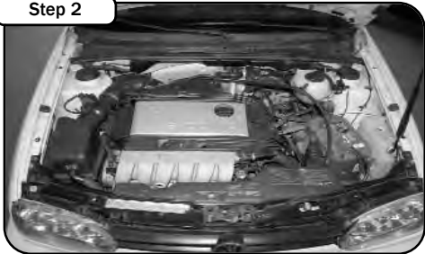
Stock intake system.