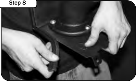
Place the supplied trim seal along the edge of the housing.