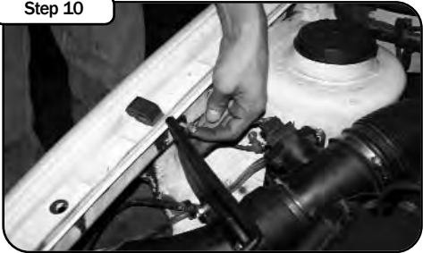
Secure the side of the housing with the supplied self tapping screw and washer.