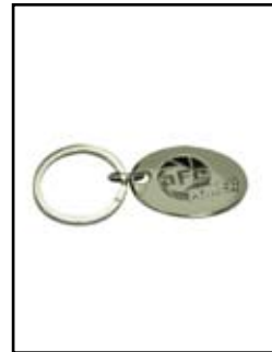
aFe Key Chain