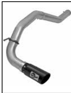
DPF-Back Exhaust System

P/N: 49-46113-B (Blk Tip) 49-46113-P (Pol Tip)