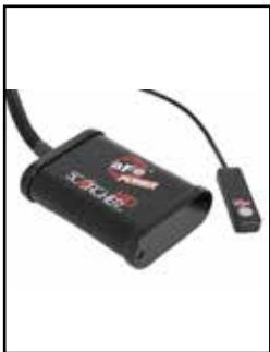
SCORCHER HD Module