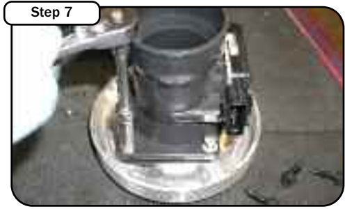
Mount the MAf sensor to the billet adapter using the four supplied M6 screws and washers.