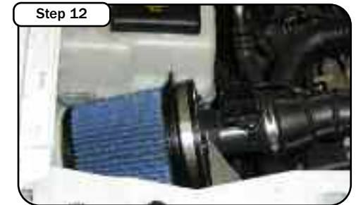
Make sure all hoses and clamps are tight and that all electrical components are secure. Re-check after a few hours of operation. Place the included CARB EO Sticker on or near the device on a smooth, clean surface. E.O. identification label is required in passing the Smoot Check Inspection.