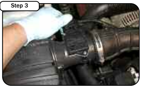
Disconnect negative post from battery terminal. Loosen the hose clamp on the intake duct. Disconnect the MAF sensor by pushing down on the clip and pulling out.