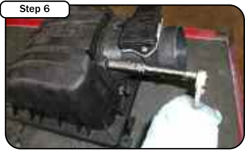
Remove MAF sensor from the upper portion of the airbox by removing the four 10mm screws.