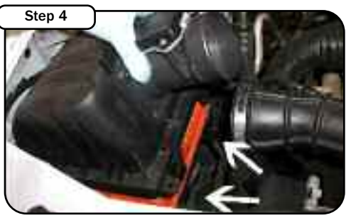
Depress the two mounting tabs located on the side of the airbox.Lift the top half of the airbox out and remove...