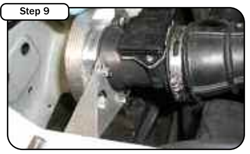
Position the intake assembly on to the support bracket and mount the assembly with the M6 screws.