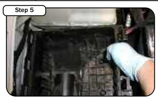
Lift up and remove bottom half of air box.