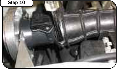
Reconnect the MAf sensor and tighten down the hose clamp.