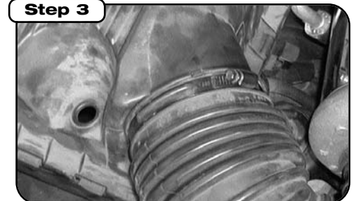
Loosen clamp at turbo inlet and remove top half of filter box and filter element.