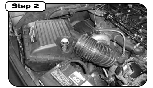
Complete stock intake.