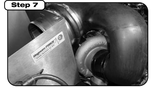
Slip boots over intake tube and install on turbo and filter housing. It may be easier to install clamps after tube is in position. If filter restriction gauge is desired, drill an 11/16 hole with a woodworking spade bit and transfer grommet and sensor to new intake tube. Sensor should be placed near larger end of tube for accurate results.