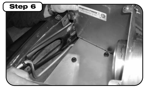
Lower housing into place, tab for ground screw tucks behind A/C line first, then lower to clear turbo housing. Housing should clear A/C line, line up rubber mounts and secure by pushing down hard or screwing mounts in. Install fender brace screw and ground screw and wire.