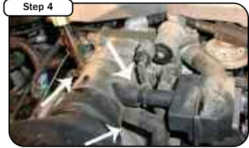
Loosen the factory hose clamp on the throttle body, and the 3/4" idle air bypass hose and the 5/8" breather hose.On some 04-05 models the IAB is not present.