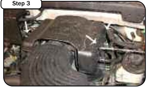
Remove the three 10mm bolts holding the throttle body cover.