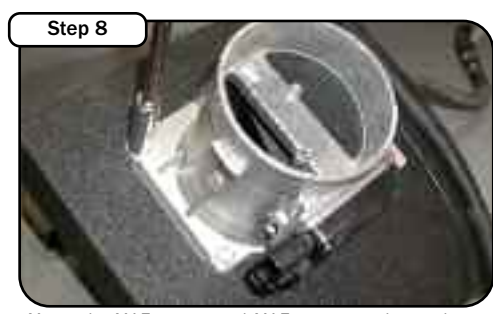
Mount the MAF sensor and MAF sensor gasket to the outside of the air filter housing. Use the (4) M6x1x20 screws and tighten down with a 10mm wrench.