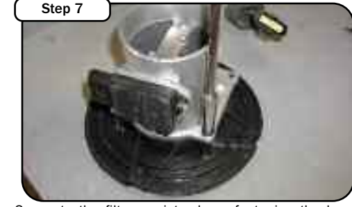
Separate the filter canister by unfastening the band clamp and removing the air filter. Disconnect the har-ness from the MAF sensor. Unbolt the MAF Sensor from the filter base and the short wire harness set aside for later use.