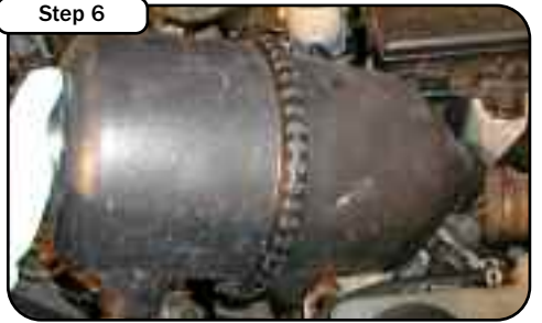
Lift air filter housing by pulling straight up it is held in place with 2 rubber gromets. On the back side is of the canister is the MAF harness.Unplug harness form vehicle and remove.