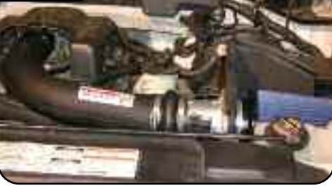
Place enclosed CARB EO sticker on a clean/smooth surface on or near the intake system. EO identifica-tion label is required to pass the smog inspection. Your installation is now complete. Close hood slowly to verify hood clearance. Check and retighten connections and filter after a few hours of operation.