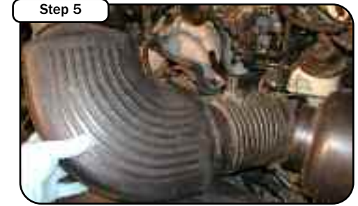
Unplug the IAT sensor and remove the intake duct from the engine. On some 04-05 models the IAT sensor is not present.