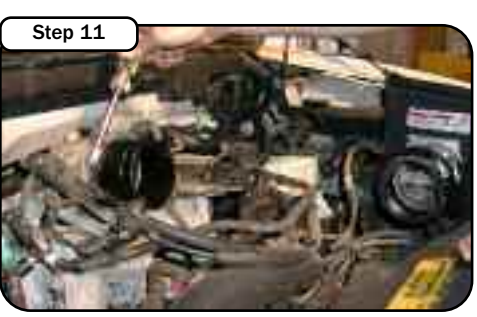
Install the hump hose and clamps on the air filter housing and install the 3" straight coupler and clamp on the throttle body.