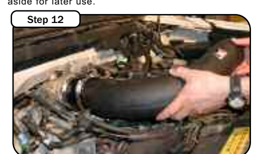
Install the smaller end of the intake tube into the throttle body coupler and insert other end into the hump coupler on the hosing. Tighten down clamps on both couplers.