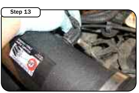
Install the rubber grommet into the IAT sensor location.Reinstall the IAT sensor and reconnect harness. At this time plug the MAF sensor into the harness and secure harness on the side of the housing with the includ-ed mounting holes. If you do not have a IAT sensor use the provided grommet and cap to seal the opening.