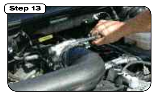
Slip coupler over throttle body and tighten clamps.