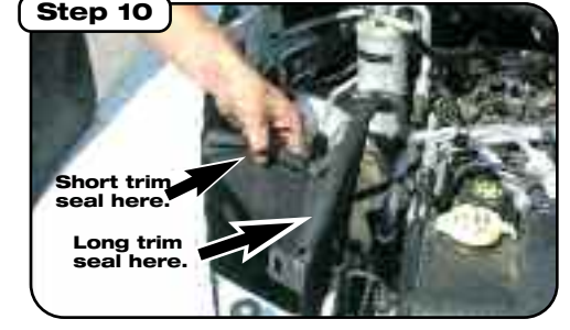
Before installing housing add trim seal. Mount shield to inner fender using OE location as seen in step 9.