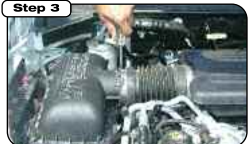
Remove air box inlet tube.