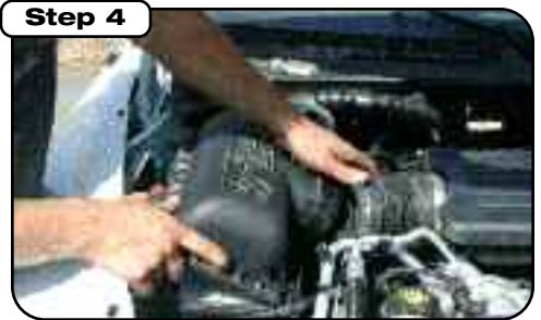
Remove OE air filter box lid. Pull up and out.