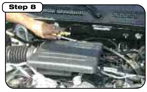
Loosen hose clamp at throttle body and pull up and