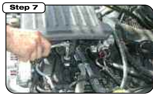
Remove two bolts that attach resonator box from manifold.