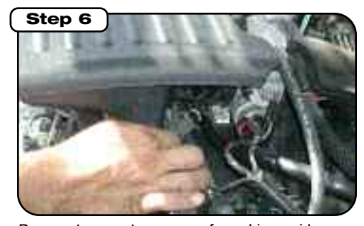
Remove temperature sensor from drivers side resonator box. Save for reuse. Note: Early 2002 V8-4.7L may not have temperature sensor in tube.