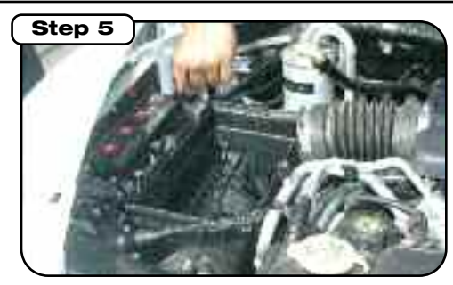
Loosen and remove bolt (one only) from OE filter box.