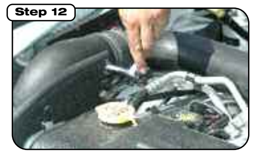
With intake tube in place mount tube to housing using supplied rubber/metal washer on each side of housing tab and split lock washer at bolt head. DO NOT OVER TIGHTEN.