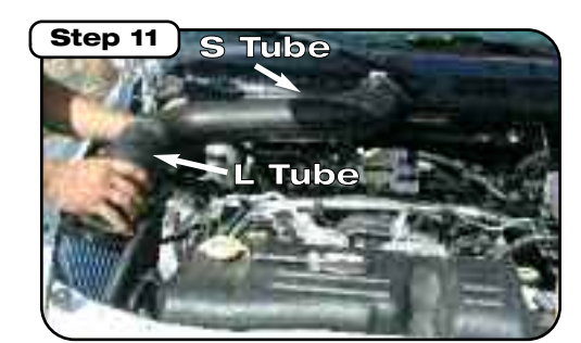
With filter attached to "L" part of intake tube connect "S" tube to "L" tube with coupler and clamps. Then slide filter down into heat shield.