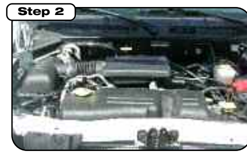
Complete stock intake.