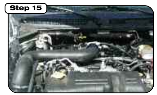
Make sure all hoses and clamps are tight and that all electrical components are secure. Check and retighten connections and filter after a few hours of operation. NOTE: Place the included CARB EO sticker on or near the device on a smooth, clean surface. EO identification label is required to pass the smog inspection.