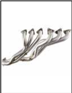
Twisted Steel Headers