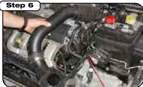
Loosen clamp on turbo inlet side of tube and remove stock intake tube from vehicle. Disconnect vent hoses from intake tube. Save as these will be reused.