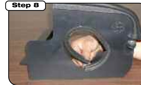
Before installing housing, install trim seal using 15" trim seal on hole cut out and 11" trim seal on panel edge.