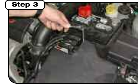
Loosen and remove solenoid mount, also loosen and remove stock airbox lid.