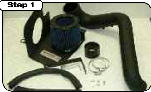
Complete Stage 2 shown.