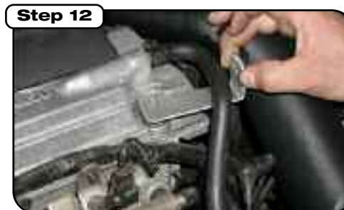
Remove plastic engine cover. Engine cover is held on by 2 grommets. Pull up cover evenly from both sides, making sure not to pull dramatically from one side so that engine cover will break. Using the aluminum bracket provided, place M6 washer onto stud, place bracket into place and secure tight with washer and nut provided. Align and install M6 bolt and lock washer to fasten bracket to the tube.