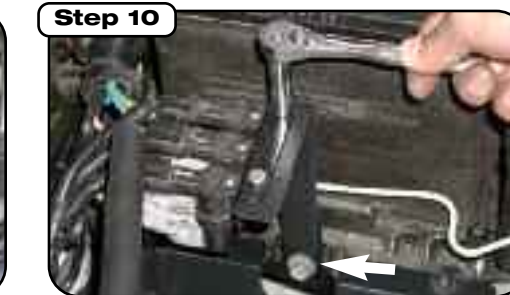
Remove and reinstall lower screw once placing solenoid bracket into place. Once bracket is secure, fasten existing solenoid bracket to upper portion of new bracket using supplied screws.