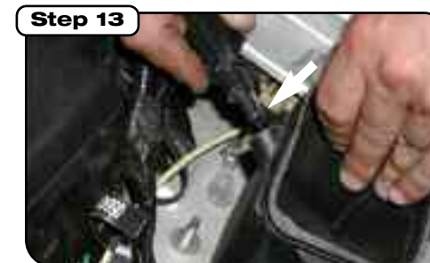
Remove air temperature sensor from stock intake housing. See step 14 for new air temperature sensor location.