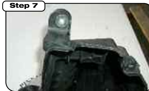
From the stock airbox, remove 1 washer and 1 rubber grommet and insert into new housing provided taking note of orientation of the washer.