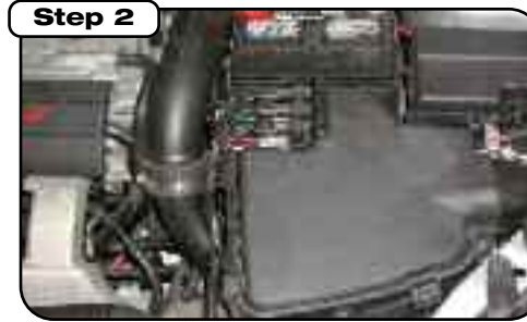
Complete stock airbox.