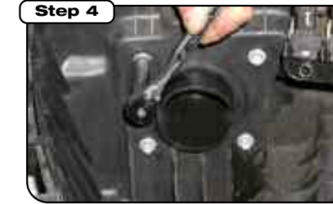
Loosen and remove 4 screws that hold stock intake tube to airbox.