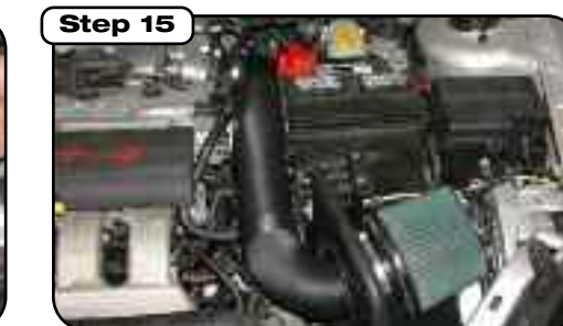
Complete kit installed. Retighten all connections after first hour of operation. Place the included CARB EO Sticker on or near the intake system on a smooth, clean surface. E.O. identification label is required in passing the Smog Check Inspection.

Note: Filter Cleaning and Re-oiling: When cleaning your aFe filter, be sure to use only aFe's "Restore Kit" (aFe P/N: 90-50001 blue oil aerosol, or aFe P/N: 90-50501 blue squeeze bottle oil). Filter Replacement: PN: 24-91033.