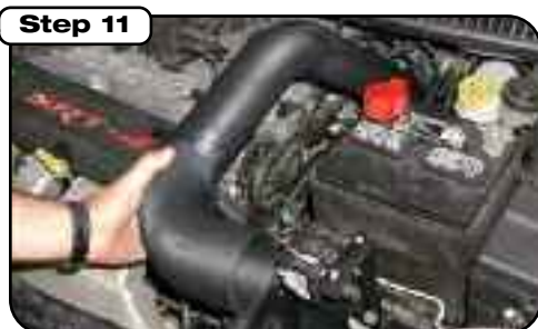
Install coupler onto the turbo side of intake tube, install tube into the vehicle and slide coupler onto turbo flange until coupler bottoms out on the lip of turbo inlet.