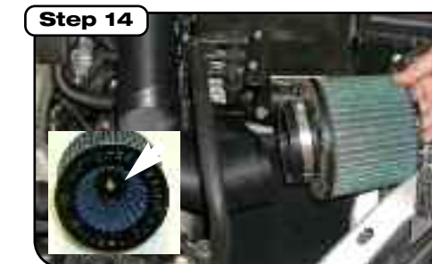
Install filter to intake tube and place temperature sensor into hole provided on the filter.