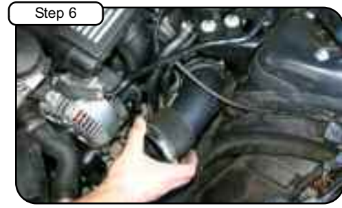
Step 6 Remove the OEM intake tube.