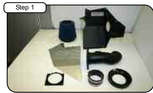
Step 1 Complete kit. Make sure you have all the components listed prior to beginning your installation.