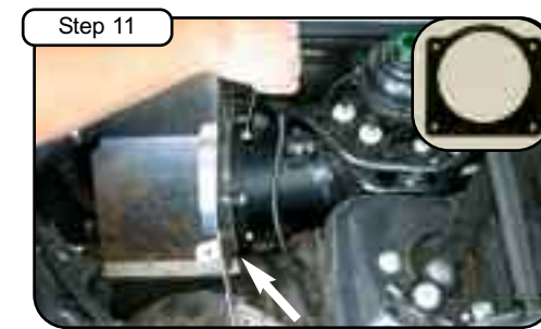
Step 11 Insert the tube flange gasket between the housing and intake tube. Bolt the aFe housing onto the aFe intake tube. Secure the bolts.