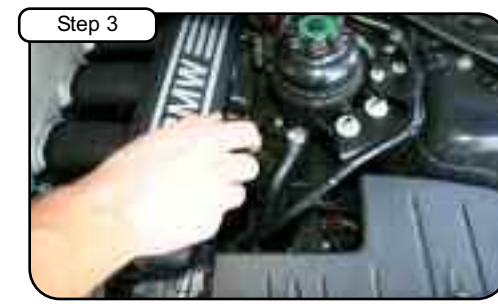
Step 3 Loosen the hose clamp on the air box, and loosen the hose clamp on the intake manifold.