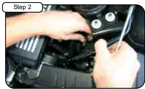
Step 2 Disconnect the MAF sensor.