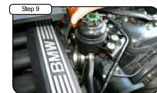
Step 9 Slide intake tube onto the manifold, and secure clamps