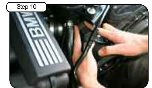
Step 10 Re-connect the MAF sensor plug.