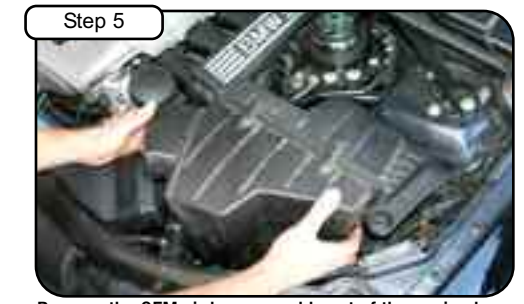
Step 5 Remove the OEM air box assembly out of the engine bay.