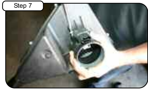
Step 7 Remove the MAF sensor from the OEM air box assembly.