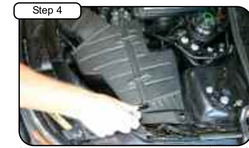
Step 4 Loosen and remove the two 10mm bolts securing the air box to the chassis.