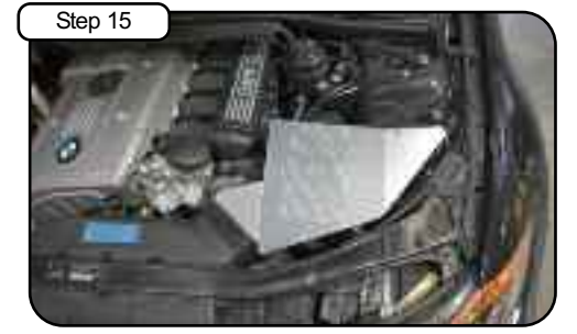
Step 15 Place enclosed CARB EO sticker on a clean/smooth surface on or near the intake system. EO identification label is required in passing the Smog Check inspection. Your installation is now complete. Make sure you tighten all clamps and check all electrical connections. Re-check periodically.