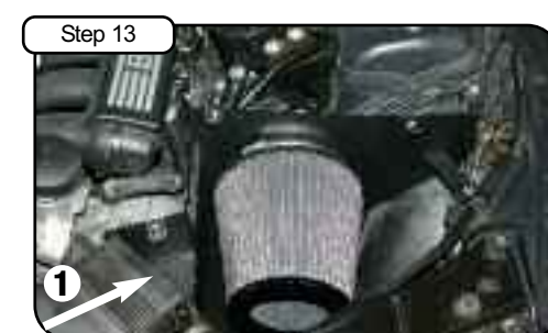
Step 13 Install air filter and tighten using 5/16" nut driver. Tighten all clamps. (1) Make sure your center air intake tube sits onto the aFe housing (as shown).