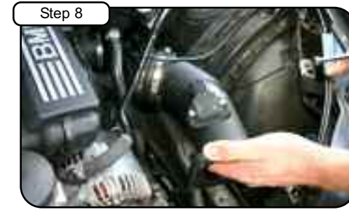
Step 8 Insert the MAF sensor assembly into the intake duct. Use the supplied gasket and screws. Secure the coupler to the intake tube using the #56 hose clamps. Do not tighten.