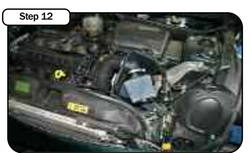
Place enclosed CARB EO sticker on a clean/smooth surface on or near the intake system. EO identification label is required in passing the Smog Check Inspection. Your installation is now complete. Make sure you tighten all clamps and check all electrical connections. Re check periodically.