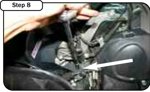
Re install one of the air box bolts removed in step 4.