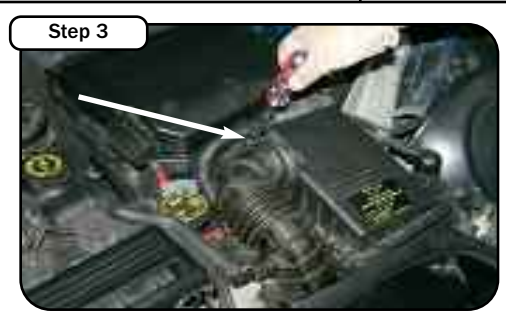
Remove the hose clamp connecting the air duct to the air box. Use a screwdriver to remove the clamp.