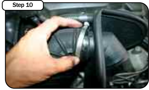
Place the new #044 clamp on the intake duct and tighten assembly to the housing inlet.