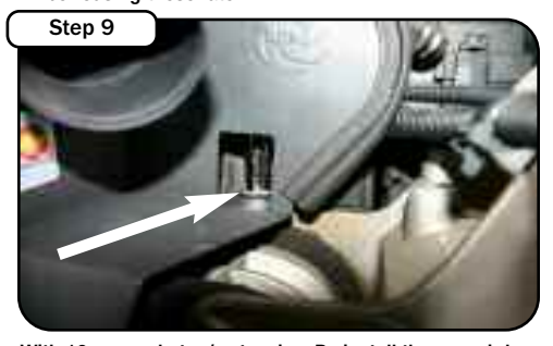
With 10mm socket w/ extension, Re install the rear air box bolt removed in step 5.