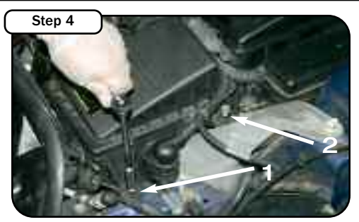
Loosen the two 10mm bolts that secure the air box on the right hand side of the engine bay. Set the bolts to the side you will be reusing these later.