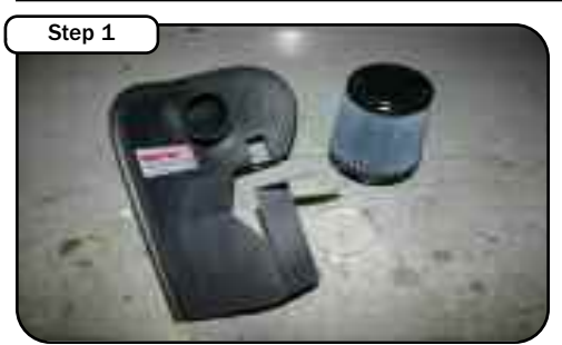
Complete intake system.