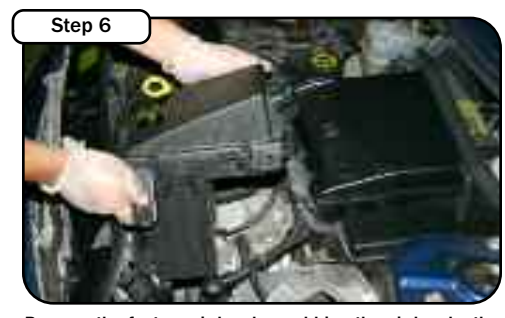
Remove the factory air box by grabbing the air box by the sides and lift up and out.