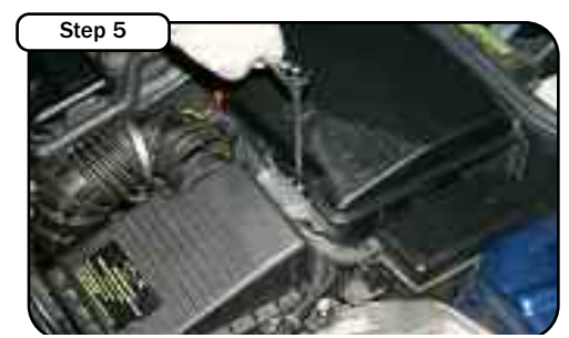
Remove the 10mm bolt that is located in the back of the air box securing the battery tray in place. Set the bolt to the side for later use.