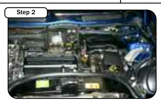
Stock intake system.