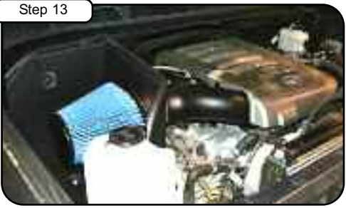
Your installation is now complete. Please check all bolts and clamps perodically. Re-tighten if necessary. Thank you for choosing aFe!

Note: Filter Cleaning and Re-oiling: When cleaning your aFe filter, be sure to use only aFe's "Restore Kit" (aFe P/N: 90-50001 blue oil aerosol, or aFe P/N: 90-50501 blue squeeze bottle oil). Filter Replacement: Pro-5R ™PN: 24-90032 (black w/blue media). Pro Dry S ™ P/N: 21-90032 (black w/white media) Pro Dry S ™ cleaning: see cleaning instruction sheet 06-00074.