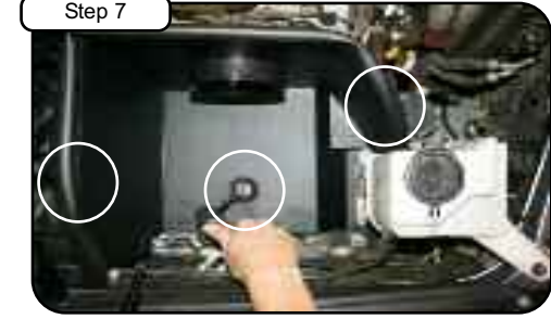
Install housing to vehicle. Use M6 screws with flat washers provided.