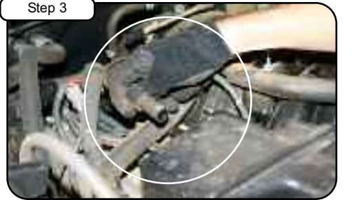
Disconnect vacuum line. Remove crankcase line out of vehicle. Disconnect MAF sensor harness.