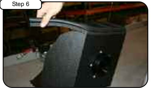
Install filter adaptor to inside of housing using 5 button head screws and wavy washers. Tighten using 5/32 hex key. Install 3/4" trim seal to housing.