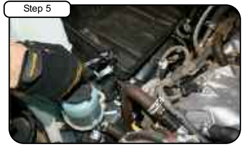
With 12mm socket or wrench loosen the 3 bolts holding in air box. Remove complete air box out of vehicle.