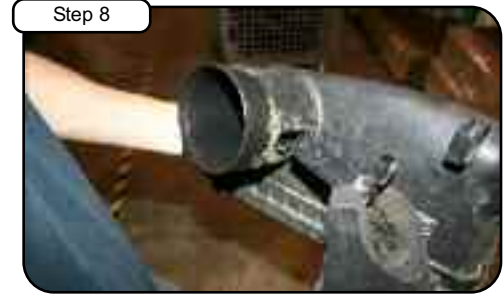
Remove MAF sensor from stock air box.