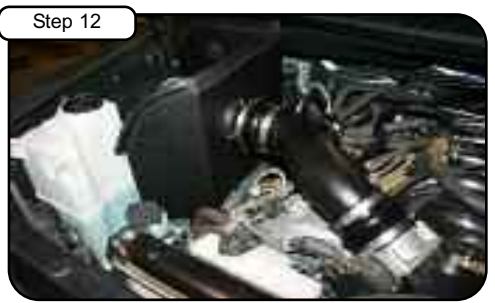
Tighten all clamps with 5/16" nut driver. Re-connect MAF sensor harness. Re-install engine cover.