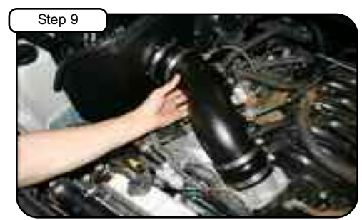
With couplers and clamps provided install new tube into vehicle. Position tube to throttle body and housing.