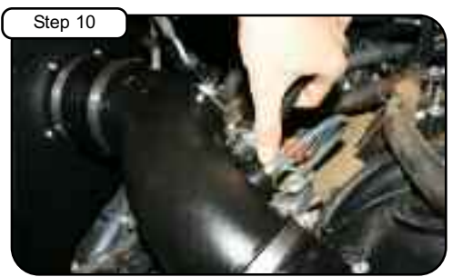
Install MAF sensor into new tube using gasket, 1/8" nylon spacers, and M4 screws provided. Install brass nipple to tube and tighten. With mini clamp install 1/2" hose to plastic fitting & tube and tighten using flat head screwdriver. Re-install vacuum line to brass fitting on tube.