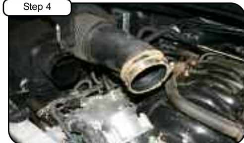
Remove OE intake tube. Un-clip upper half of air box and remove air filter.