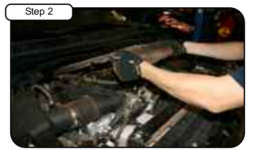
Remove engine cover by grasping as shown and carefully lifting up.