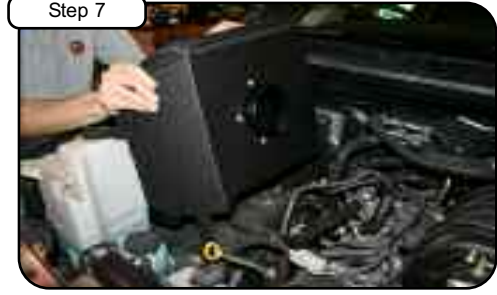
Step 7 Install housing to vehicle. Use M6 screws with flat washers provided. Make sure 1/4" nylon spacer is between housing and fender when installing.