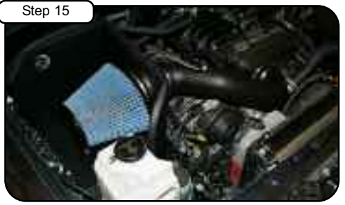
Step 15 Your installation is now complete. Please check all bolts and clamps periodically. Re-tighten if necessary. Thank you for choosing aFe!