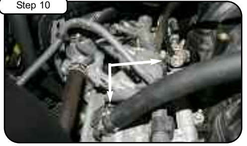
Step 10 Remove factory vacuum line and crank case breather. Install new 5/32" line to vehicle. With mini clamp install 5/8" hose to vehicle and tighten using flat head screwdriver.