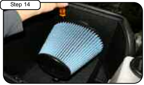
Step 14 Install air filter and tighten using 5/16" nut driver. Re-install small engine cover.