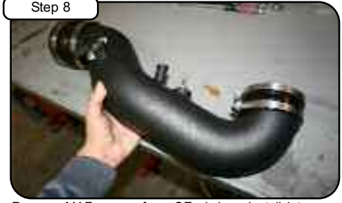
Step 8 Remove MAF sensor from OE air box. Install into new tube using gasket, 1/8" nylon spacers, and M4 screws provided. Install brass nipple to tube and tighten. Install couplers with clamps to tube.