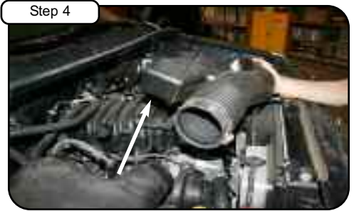
Step 4 Remove OE intake tube. Un-clip upper half of air-box and remove with OE air filter.