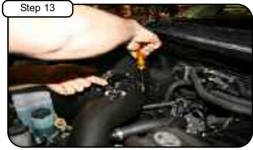
Step 13 Tighten clamps at housing side using 5/16" nut driver. Re-connect MAF sensor harness.