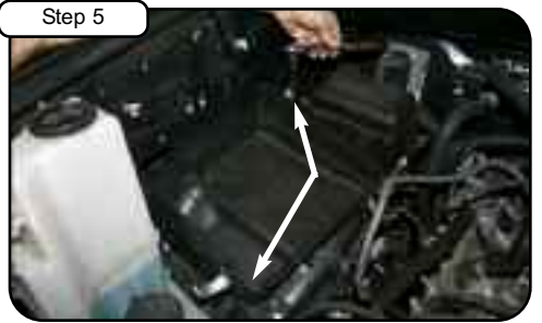
Step 5 With 10mm socket or wrench loosen both bolts holding in air-box. Remove complete air-box out of vehicle.