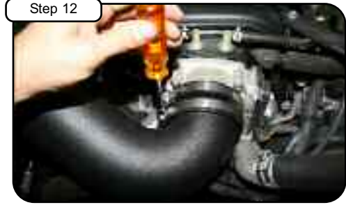
Step 12 Tighten clamps at throttle body with 5/16" nut driver.