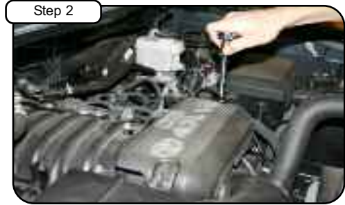
Step 2 With 10mm wrench or socket, loosen bolts on engine cover. Disconnect MAF sensor harness.