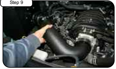
Step 9 Install new tube into vehicle. Position tube to throttle body and housing. Do not tighten clamps.