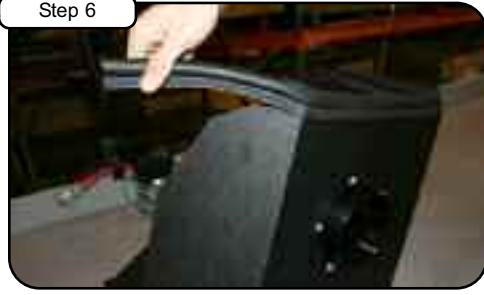
Step 6 Install filter adaptor to inside of housing using 5 button head screws and wavy washers. Tighten using 5/32 allen key. Install 3/4" trim seal to housing.