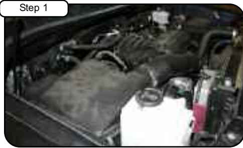
Step 1 Complete Stock Intake.

advanced FLOW engineering™ P.O. Box 1719 Corona, CA 92878 Support: 951-493-7100 www.aFePower.com