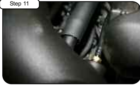
Step 11 Install new vacuum line and crank case breather to tube.