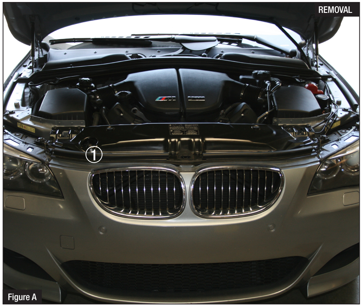
Refer to Figure A for step 1