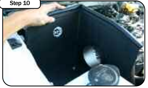
Step 10 Install 3/4" trim seal to housing. Secure the housing to the engine compartment with M8 screws and washers provided.