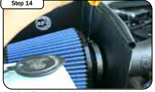
Step 14 Install air filter into housing and tighten using 5/16" nut driver.