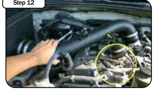
Step 12 Place couplers and clamps on tube and install. Install grommet and plastic fitting into tube. Now install into vehicle. Install small 5/32" hose to vacuum line and brass fitting supplied.