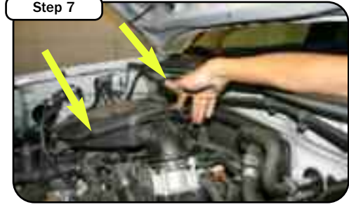
Step 7 Disconnect the breather hose and the vacuum hose connected to the intake resonator. Loosen the clamp on the throttle body. DO NOT REMOVE INTAKE RESONATOR AT THIS TIME.