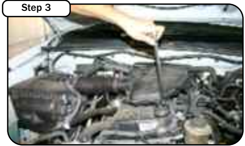
Step 3 Remove the three bolts that secure the intake resonator to the valve cover. Loosen the intake hose clamps.