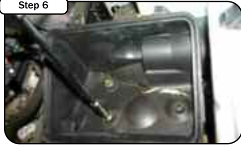
Step 6 Remove the three 12mm bolts securing the lower air box. Remove the bolt securing the windshield washer reservoir. Remove the lower air box.