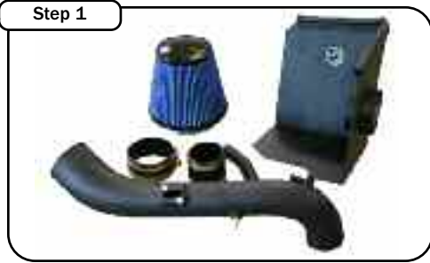
Step 1 Complete kit. Verify all components are present prior to beginning installation.