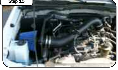
Step 15 The installation is now complete. Check all clamps and connection. Periodically check all clamps and hoses. Thank you for choosing aFe!