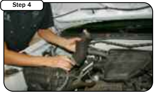
Step 4 Remove the intake hose.