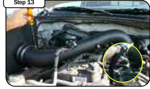
Step 13 Install crank case hose with mini clamps provided and tighten to tube. Tighten all clamps. Reconnect the MAF sensor harness.