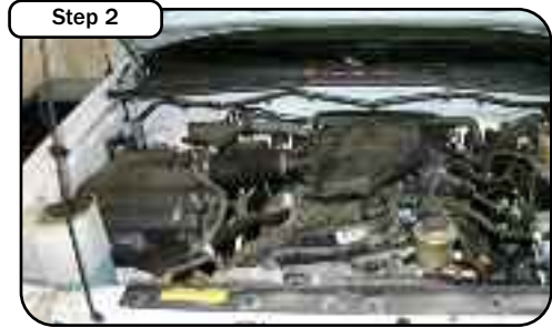
Step 2 Complete stock intake.