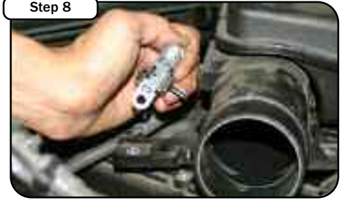
Step 8 Remove the VSV located on the back side of the intake resonator. Remove intake resonator.