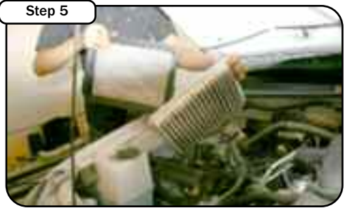
Step 5 Disconnect the MAF sensor and remove the upper air box and air filter.