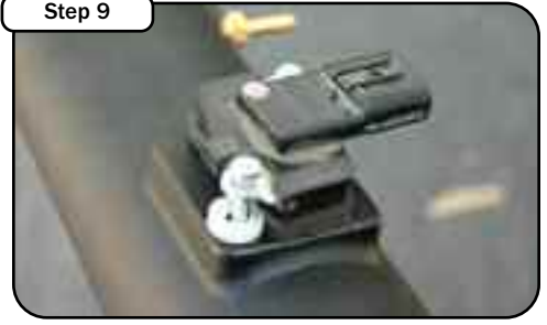
Step 9 Transfer the MAF sensor to the new intake tube with nylon spacers, screws, and gasket provided.