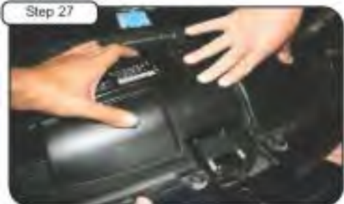
Step 27 Have person B re-install the cover and secure with plastic pin clips that were removed earlier. (See steps 19-21)