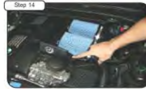
Step 14 Install air filters and tighten with 5/16" nut driver and connect vacuum line.