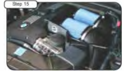
Step 15 Your Intake installation is now complete. Please check all clamps and hoses periodically and tighten.

Continue to page 2 for D.A.S. Installation. →