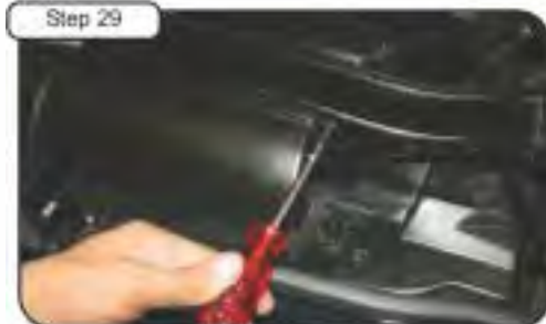
Step 29 Re-position ram air duct from step 3. Secure using the 2 screws from step 17 and tighten using T25 torx bit.