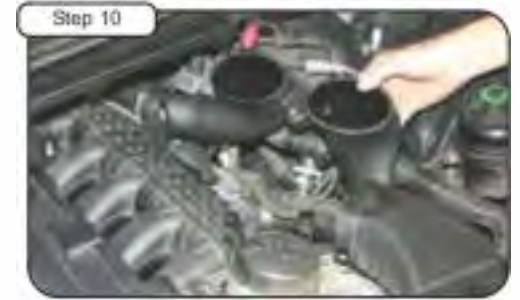
Step 10 Install new tube into vehicle and pull back towards driver fender. Do not tighten clamps.