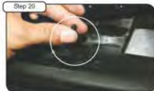
Step 20 Remove plastic pin.