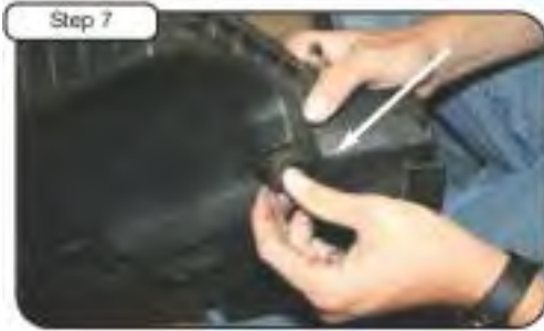
Step 7 Remove the 3 rubber grommets from the air box. (To be used in step 9.)