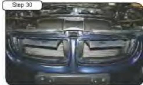
Step 30 Your completed D.A.S. installation will look like this. Check and make sure they are secure. Re-install grills by lining up tabs and pushing them in until they snap into place.

NOTE: Place enclosed CARB EO sticker on or near the device on a smooth, clean surface. EO identification label is required to pass the smog test inspection.