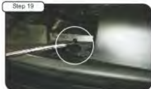
Step 19 With flat head screwdriver, carefully pry and push up plastic pin.