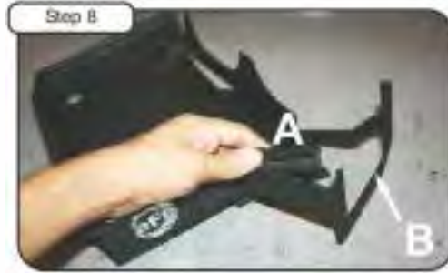
Step 8 A) Attach 7/16" trim seal to top of housing. B) Attach rubber edge trim seal to ram air cut out on housing.