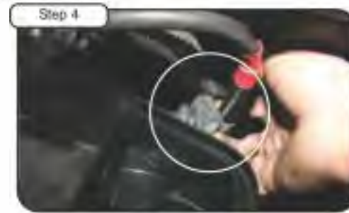
Step 4 Pull back rubber mount attached to battery cable. Use pliers if necessary. This will allow stock clamp to be loosened. (To be done in step 5B.)