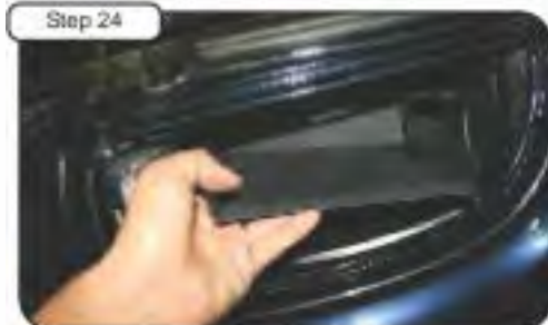
Step 24 Install 05-01016 Driver side D.A.S.