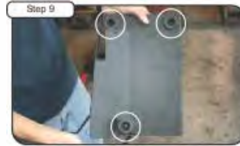
Step 9 Install rubber grommets from step 7 on new housing.