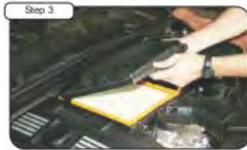
Step 3 Unclip upper half of air box to remove lid and filter.