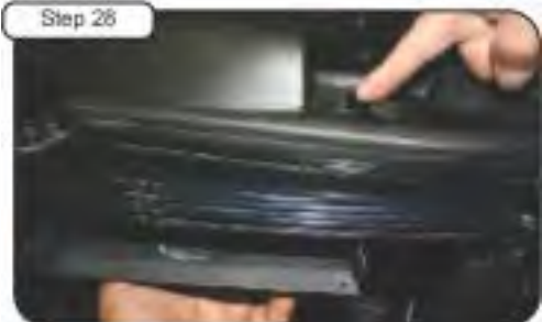
Step 28 Detail of properly installed plastic pin clips. Make sure pin clips are through hole on scoops allowing to secure and hold in place!