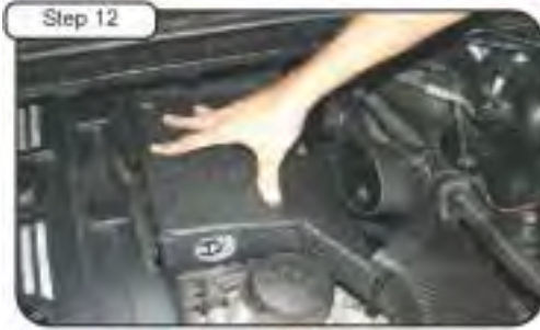
Step 12 Push down housing allowing grommets to seat. Align threaded insert with hole on housing.