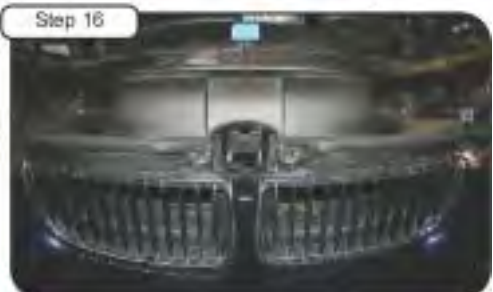
Step 16 Complete Stock Configuration.