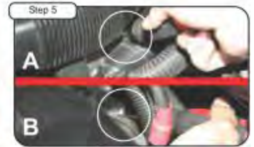
Step 5 A) Loosen clamp closest to the radiator with 1/4" nut driver. B) Loosen clamp closest to fire wall with 1/4" nut driver. Leave clamps in position.