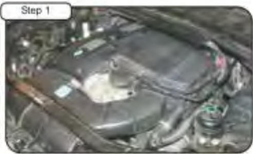
Step 1 Complete Stock Intake.