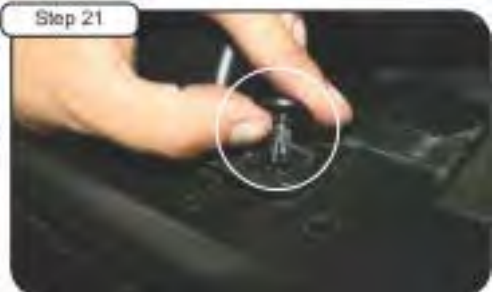
Step 21 Remove plastic clip. Repeat steps 19-21 for remaining clip. (Save for later installation)