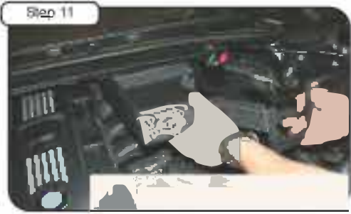
Step 11 Install housing into factory position.