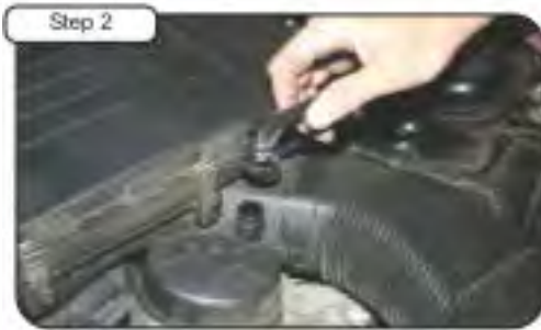
Step 2 Disconnect vacuum line and pull back.