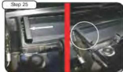
Step 25 Position scoop tab on plastic support as shown. (Repeat for 05-01017 Passenger side D.A.S.)