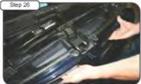
Step 26 For easier installation, the next three steps will require an assistant. Have person A hold the scoops in position as shown.