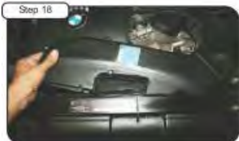
Step 18 Pull back ram air duct and remove.