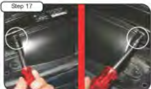
Step 17 Remove screws on ram air duct using T25 torx bit. (Save for later installation)