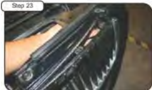
Step 23 The grills are held in place with push clips. To remove, reach in behind each grill and push forward while using other hand to support grill from the front.