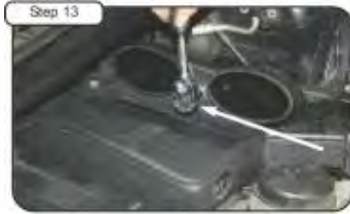
Step 13 Install screw, washer and wavy washer provided, and tighten with 10mm socket or wrench. Tighten clamps to tube with 1/4" nut driver.