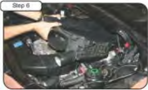
Step 6 Remove complete air box from vehicle.