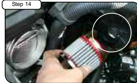
Attach crankcase filter to smog pump and tighten using 5/16" nut driver.