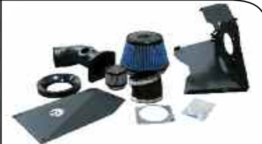
Complete Kit w/ Parts