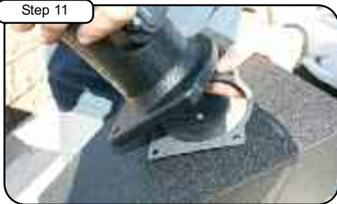
Attach tube to outside of housing using gasket provided.