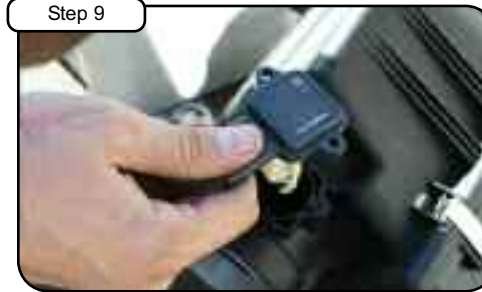
Carefully remove MAF sensor.