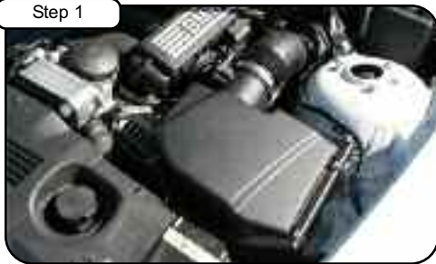
Complete Stock Intake. Disconnect battery before install.