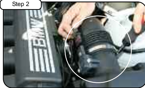
Disconnect MAF sensor and loosen clamp on air box using 1/4" nut driver.