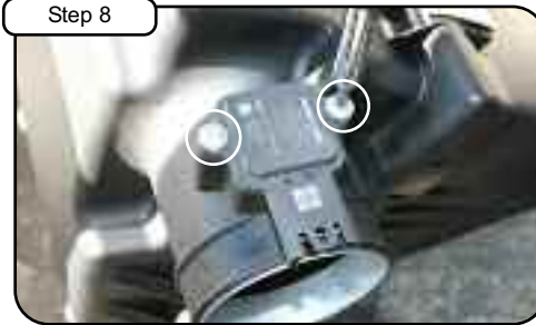
Loosen the 2 screws holding in MAF sensor using T25 Torx bit.