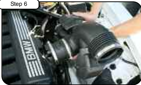
Remove Intake tube out of vehicle.