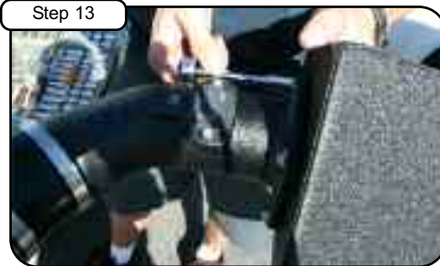
Using the 4 M6 x 1 x 25 screws and 4 flat washers provided tighten and secure to adaptor. Tighten using 10mm socket or wrench.