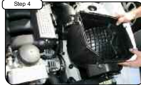
Lift and pull bottom half of air box out of vehicle.