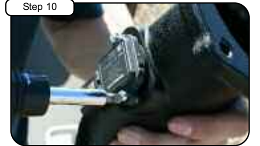
Install MAF sensor to tube using Gasket provided and 2 screws. Tighten using flathead screwdriver. Make sure arrow is in direction towards Throttle Body.