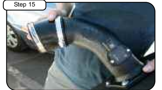
Attach coupler to tube with clamps provided. Do not tighten.