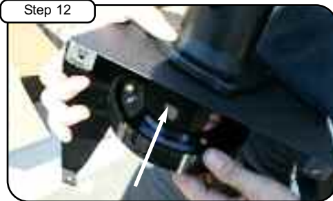
Attach filter adaptor to inside of housing.