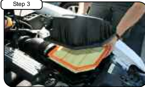
Lift up and pull upper half of air box out. Remove air filter.