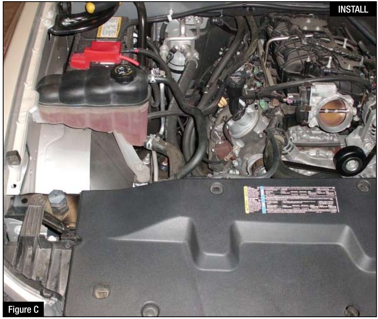
Refer to Figure C for step 7

Step 7. Remove stock intake tube from vehicle.