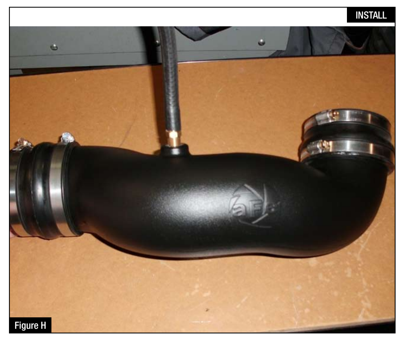
Refer to Figure H for step 16