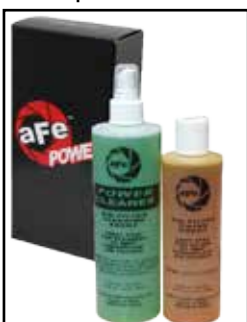
Gold Squeeze Restore Kit