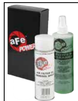
Gold Aerosol Restore Kit