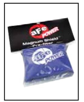
P/N: 28-10091 Yellow P/N: 28-10092 Red P/N: 28-10093 Black P/N: 28-10094 Blue