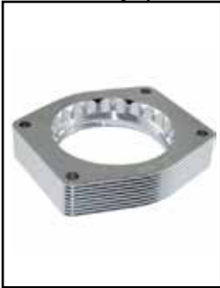
Throttle Body Spacer