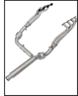
Twisted Steel Headers

P/N: 49-44062-B (Blk Tips) 49-44062-P (Pol Tips)