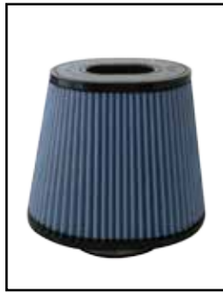
Pro 5R Air Filter