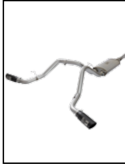
Cat-Back Exhaust System

P/N: 49-44071-B (Blk Tips) 49-44071-P (Pol Tips)