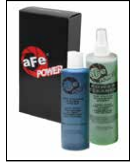
Blue Squeeze Restore Kit