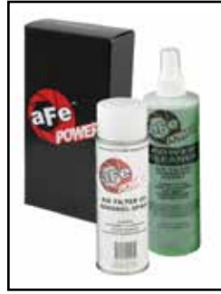
Pro DRY S Restore Kit