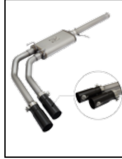
Side Exit Exhaust System

P/N: 49-44062-B (Blk Tips) 49-44062-P (Pol Tips)