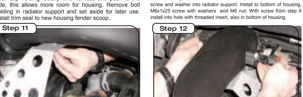
Re-connect the MAF sensor and use provided 5/16" breather hose to connect the intake duct to the crankcase breather on the engine valve cover.

Install housing into vehicle. With hardware provided, install M6 x1x30