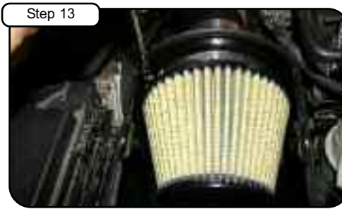
Install air filter and tighten using 5/16" nut driver.