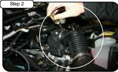
Loosen clamp using 5/16" nut driver at throttle body.