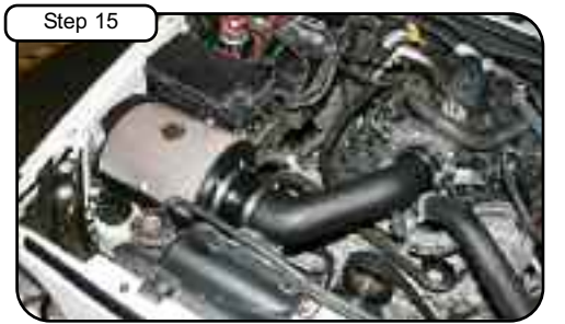
Place enclosed CARB EO sticker on a clean/smooth surface on or near the device. EO identification label is required in passing the Smog Check Inspection. Your installation is now complete. Please check all bolts and clamps periodically. Re-tighten if necessary. Thank you for choosing aFe!

Note: Filter Cleaning and Re-oiling: When cleaning your aFe filter, be sure to use only aFe's "Restore Kit" (aFe P/N: 90-50001 blue oil aerosol, or aFe P/N: 90-50501 blue squeeze bottle oil or aFe P/N: 90-50000 gold oil aerosol, or aFe P/N: 90-50500 gold squeeze oil). Air Filter Replacement: Pro-5R™ P/N 24-55505 (black w/blue media) Pro-GUARD 7™ P/N 72-55505 (black w/gold media) Pro Dry S™ P/N 21-55505 (black w/white media) Pro Dry S™ cleaning: see cleaning instruction sheet 06-00074 For replacement part(s) or "Restore Kit" please call aFe sales/tech support @ 951-493-7100