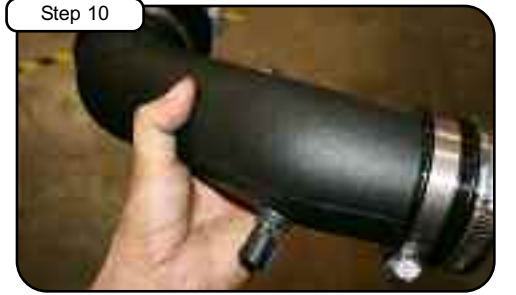
Install couplers with clamps to tube. Remove temp sensor from OE intake tube and install into new tube using grommet provided.