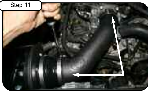
Install tube to throttle body and housing. Tighten clamps using 5/16" nut driver.