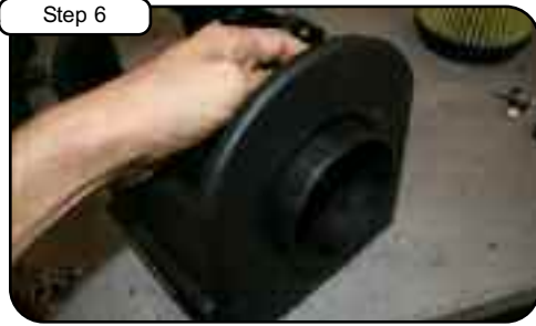
Install filter adaptor to inside of housing using button head screws and wavy washers.