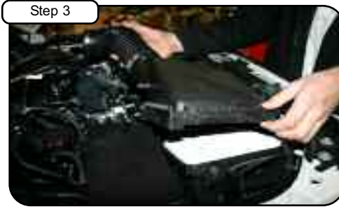
Disconnect crank case line at OE airbox. Disconnect OE clips holding in upper half of OE airbox. Remove upper half of airbox from vehicle.