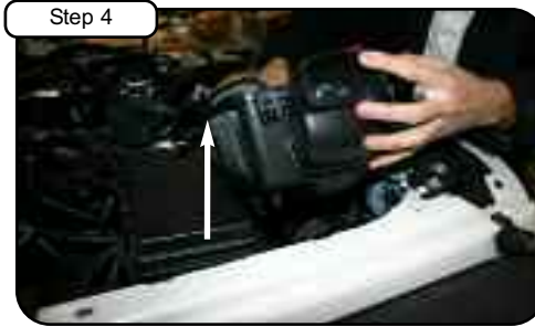
Carefully remove bottom half of airbox. (caution, this may require some force)