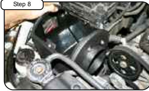
Install housing into vehicle. Use factory screw from step 5 to mount tab on new housing.