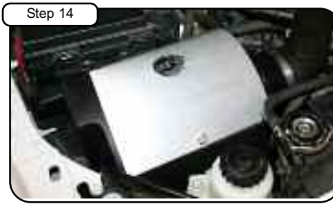
Install housing cover and tighten using thumb screws