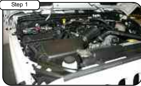
Complete Stock Intake.

advanced FLOW engineering™ P.O. Box 1719 Corona, CA 92878 Support: 951-493-7100 www.aFepower.com