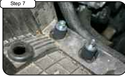
Remove the 2 factory rubber grommets. Install isolation mounts to OE mounting position. Use nuts and washers provided. Tighten using 9/16" socket or wrench.