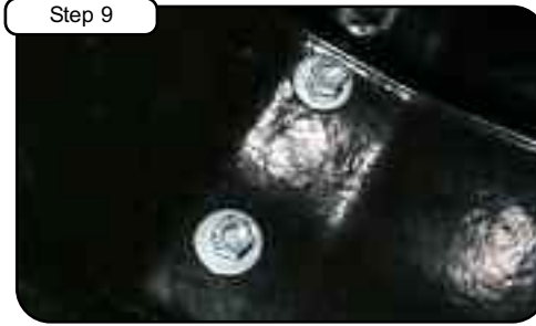
Place nut and washer to mounts and tighten.