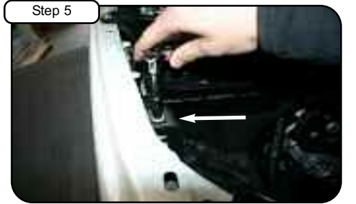
Loosen 10mm bolt holding in airbox bracket. Save for later install.