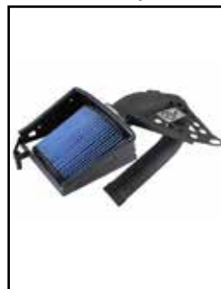
Air Intake Systems