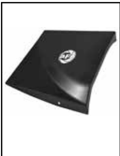
Stage 2 Cover