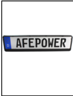
German License Plate