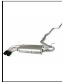
Cat Back Exhaust