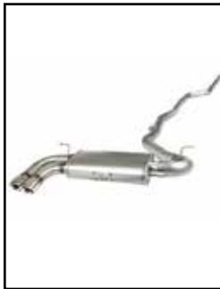
Cat Back Exhaust