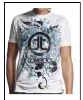
P/N: TP-7004T MED TP-7005T LRG TP-7006T XLG TP-7007T 2XL