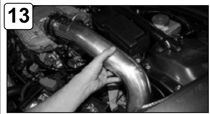
Install upper intake tube and position to throttle body. Do not tighten.