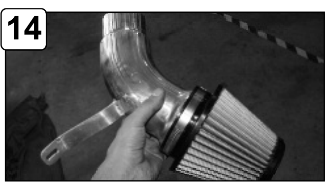
Install filter and tighten using 5/16" nut driver to lower intake tube. Attach pre filter to filter.