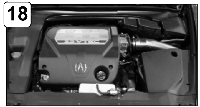
The installation of your Takeda performance intake is now complete. Please check all components and retighten if necessary. Thank you for choosing Takeda!