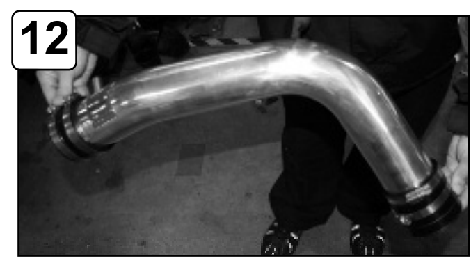
Attach couplers with clamps to upper intake tube. Do not tighten.