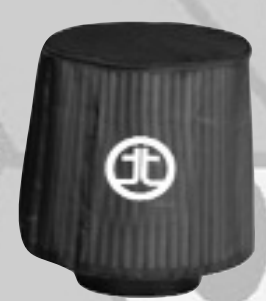
Pre Filter P/N: TP-7011B

Note: Filter Cleaning: When cleaning your Pro Dry 5 ™ filter, be sure to use only "Restore Kit" (Takeda P/N: TP-7016C Pro Dry 5 ™ cleaner only.)