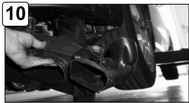
Secure front of vehicle on jack stands. Remove all driver side front plastic pins on bumper fender and inner fenderwell to pull back cover enough to allow removal of resonator air box. Wheel removal is optional. With 10mm socket or wrench loosen the 3 bolts holding in resonator air box and remove.