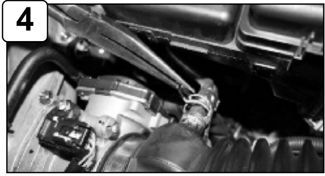
Loosen clamp on throttle body using 10mm socket or wrench. With pliers pull crank case line away from tube.