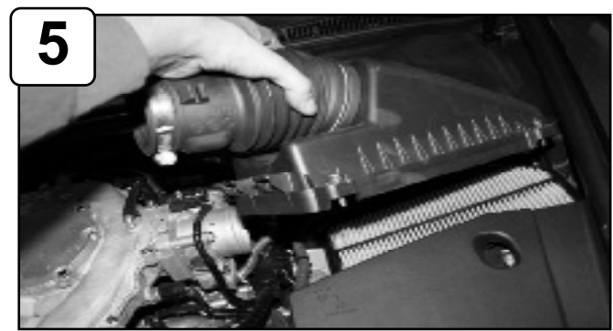
With 8mm socket or wrench loosen the 4 screws holding in upper half of air box and remove.