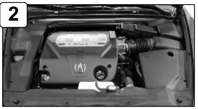
Complete Stock intake. Please disconnect battery terminals before installation. Do not attempt to install kit if vehicle is not cold!