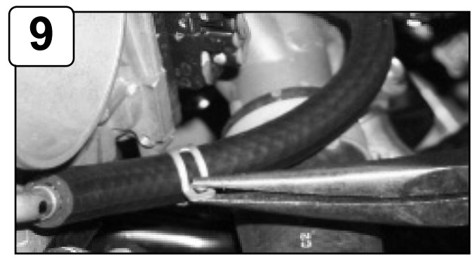
Replace throttle body coolant line with 5/16" hose provided and secure with clamps used from step 8.