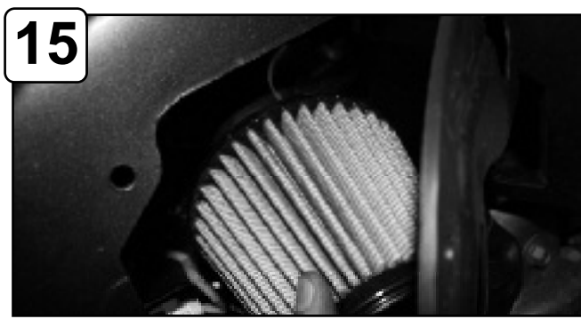
Install and connect upper and lower intake tubes and position. Position tab to isolation mount from step 11.