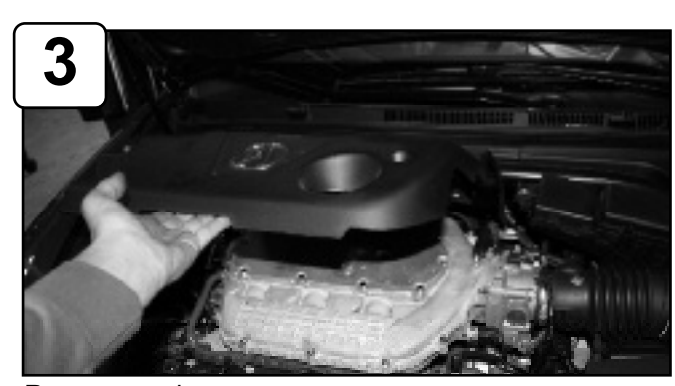
Remove engine cover.