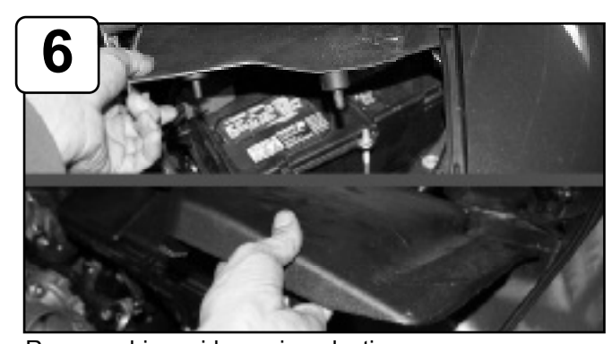
Remove driver side engine plastic covers.