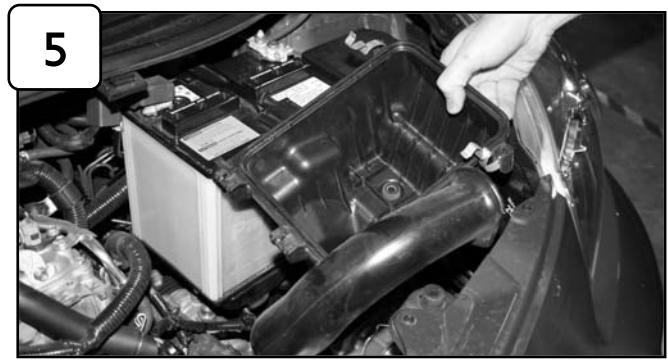
With 10mm socket or wrench loosen the 3 bolts holding in bottom half of air box and remove.