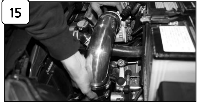
With 05-01005 coupler and clamps on throttle body install upper intake tube to vehicle and position to MAF sensor using 05-00418 coupler and clamps. Do not tighten.