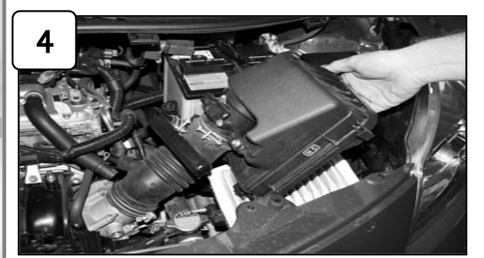
Unclip upper half of air box. Remove upper half of stock intake.