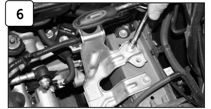
With 12mm socket or wrench, loosen air box bracket and remove.