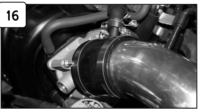
Position hole on coupler to fitting on crank case line and install to coupler. Tighten all clamps using 5/16" nut driver.