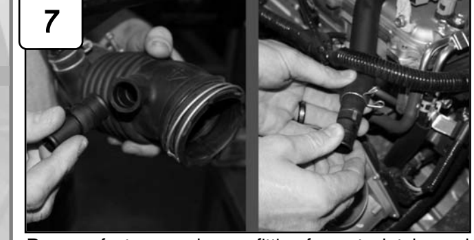
Remove factory crank case fitting from stock tube and re-install.