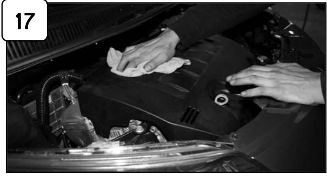
Install engine cover. Re-connect battery terminals. Re-secure plastic cover and pins from step 11.