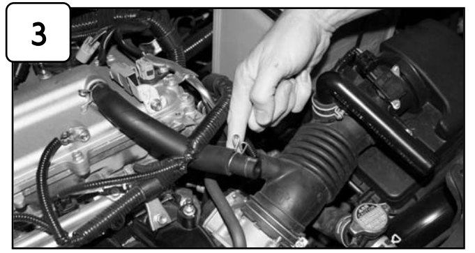
Disconnect MAF sensor harness. Loosen clamps using 10mm socket or wrench. Pull crank case line away from tube.