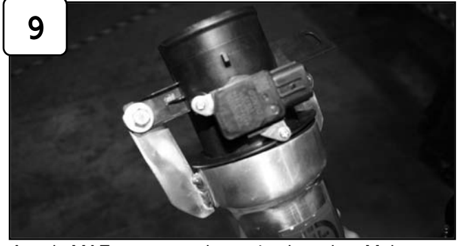
Attach MAF sensor to lower intake tube. Make sure gaskets on sensor are completely inside of tube. With provided M6 screw, nut, wavy and flat washers, secure tabs on sensor to intake tube. Tighten using 10mm socket or wrench.