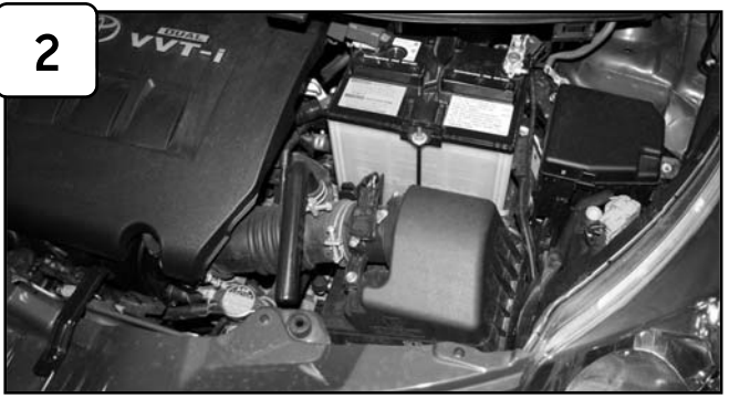
Complete Stock intake. Please disconnect battery terminals before installation.