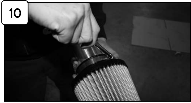
Install air filter and tighten using 5/16" nut driver. Attach pre-filter to filter.