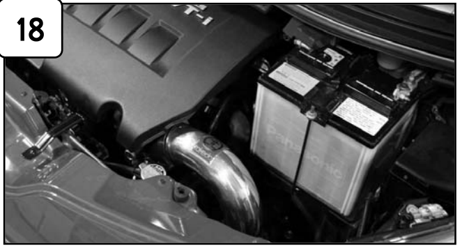
The installation of your Takeda performance intake is now complete. Please check all components and retighten if necessary. Thank you for choosing Takeda!