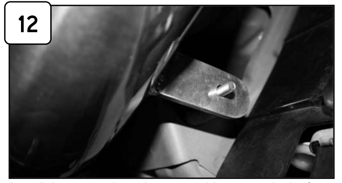
Install lower intake tube assembly into vehicle from bottom of vehicle and position lower tab to M6 isolation mount from step 8. Tighten using 10mm socket or wrench.