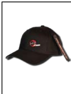
aFe Power Hat