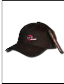
aFe Power Hat