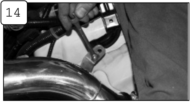
Using isolation mount provided, secure to vehicle and postion tab on tube to isolation mount. Tighten using the washer and nut provided with 10mm socket or wrench.