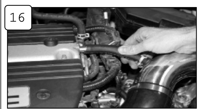
Install provided 5/8" hose to engine and tube. Re-connect MAF sensor harness and battery terminals.