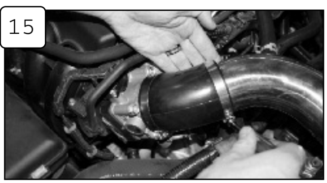
Position and tighten clamps on tube using 5/16" nut driver.