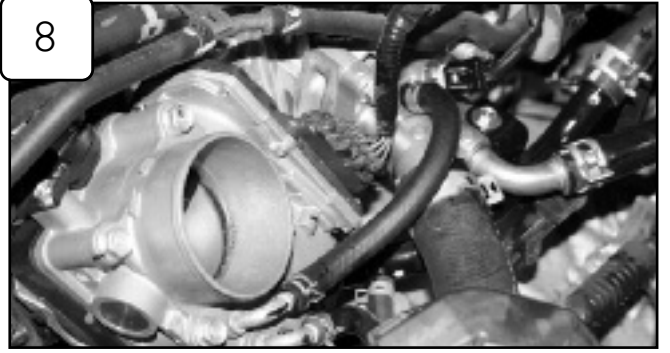
Replace throttle body coolant line with 5/16" hose provided and secure with clamps used from step 7.