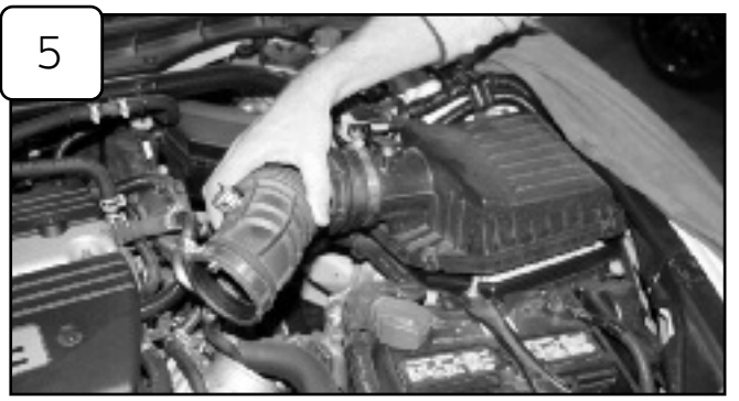
Un-clip upper half of air box and remove stock intake.