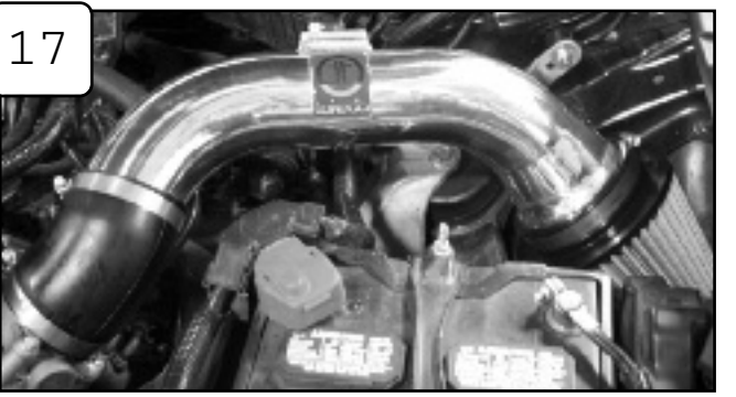
The installation of your Takeda performance intake is now complete. Please check all components and retighten if necessary. Thank you for choosing Takeda!

Place enclosed CARB EO sticker on a clean/smooth surface on or near the intake system. EO identification label is required in passing the Smog Check Inspection.