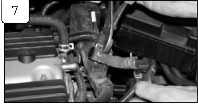
Remove crank case line attached with throttle body coolant line. Have a shop towel or rag handy to catch any leaking coolant. Use pliers to remove both lines. Save small clamps for later install. Caution: Coolant may leak from line when removing!