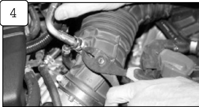
With pliers remove crank case line from intake tube.