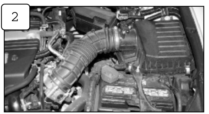
Complete Stock intake. Please disconnect battery terminals before installation. Do not attempt to install kit if vehicle is not cold!