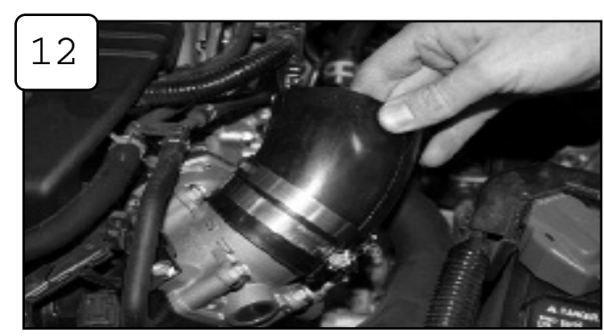
Install elbow coupler to throttle body and position using clamps provided. Do not tighten.