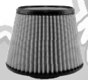
Replacement Filter P/N: TF-9010D