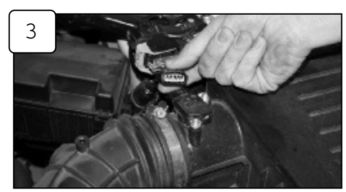
Disconnect MAF sensor harness. With Phillips or 10mm socket or wrench loosen both clamps on intake tube.