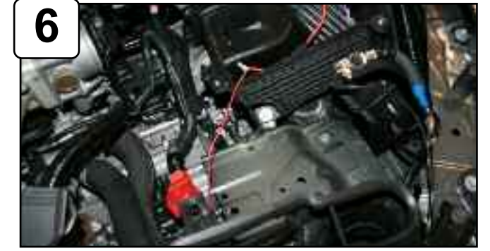
Remove battery out of vehicle.