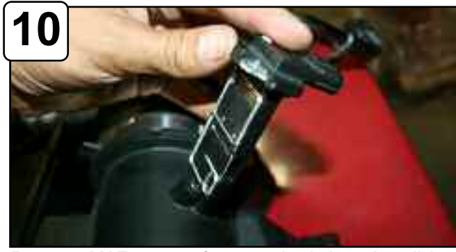
Remove MAF sensor from stock air box. Install into new tube and secure using provided M4 screws.