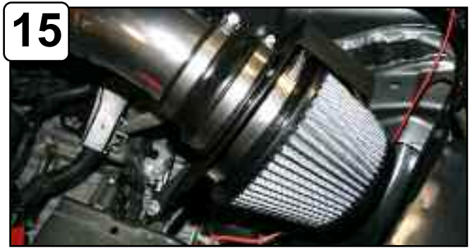
Install housing into vehicle and position tab to isolation mount from step 11. Note:Tube may need to be positioned to fit cut out on factory engine cover.

3.7L engine , install tube with 05-00636 coupling and #48 clamp and #52 clamp. Do not tighten.