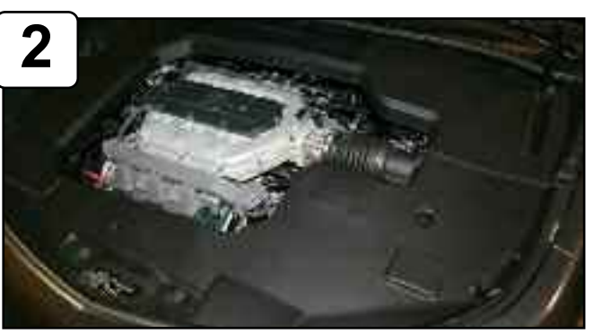
Complete Stock intake. Please disconnect battery terminals before installation. Do not attempt to install kit if vehicle is not cold!