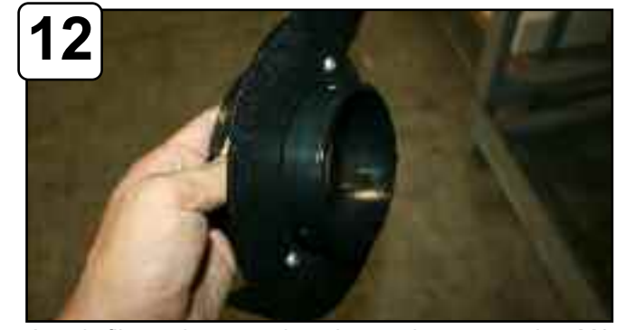
Attach filter adaptor to housing and secure using M6 button head screws provided. Tighten using 4mm allen key.