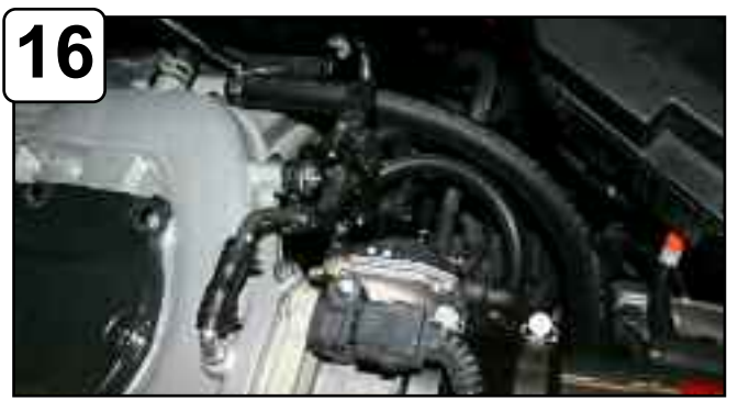
Install provided 5/8" hose to tube and engine. Using provided clamp tighten on engine side only.