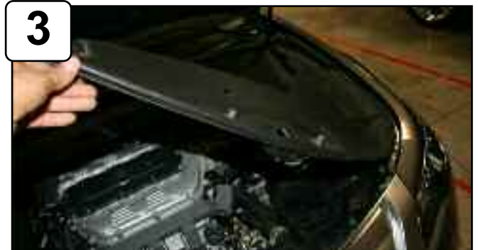
Remove all driver side plastic engine covers.