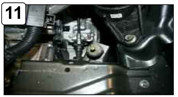
Install isolation mount to factory mounting insert next to battery tray.