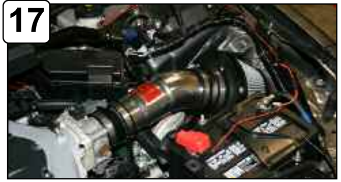
Tighten all clamps using 5/16" nut driver. Re-install battery and connect battery terminals. Re-install driver side plastic covers from step 3.