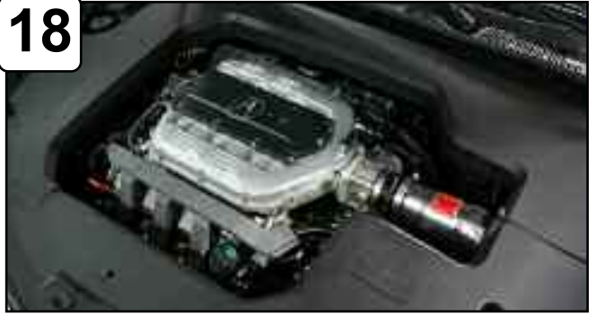
The installation of your Takeda performance intake is now complete. Please check all components and retighten if necessary. Thank you for choosing Takeda!

Place the included CARB EO sticker on or near the intake system on a smooth, clean surface. E.O. identification label is required in passing the smog check inspection.