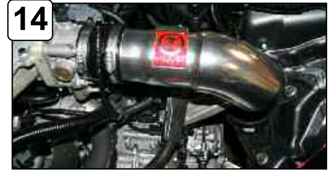
3.5L engine, install tube with 05-01028 coupling and two #48 clamps. Do not tighten.

3.7L engine , install tube with 05-00636 coupling and #48 clamp and #52 clamp. Do not tighten.