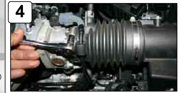
Loosen clamp on throttle body using 10mm socket or wrench. With pliers pull crank case line away from tube.