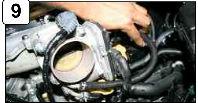
Replace throttle body coolant line with 5/16" hose provided and secure with clamps used from step 8.