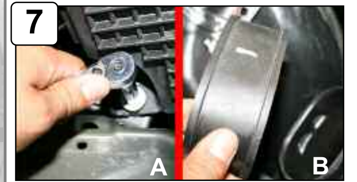
A)With 10mm socket or wrench loosen bolt on stock bottom air box and remove. B)Remove factory coupling.