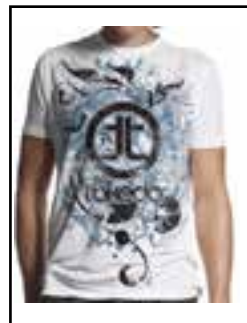
Takeda Grundge Tee

P/N: TP-7004T MED TP-7005T LRG TP-7006T XLG TP-7007T 2XL