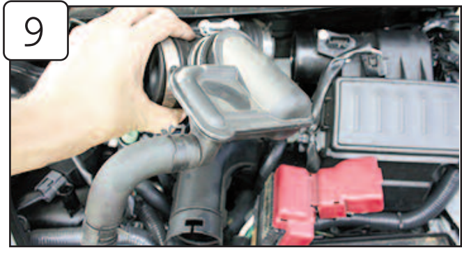
Remove the stock intake tube.