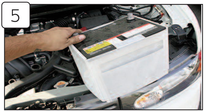
Disconnect battery terminals and remove battery.