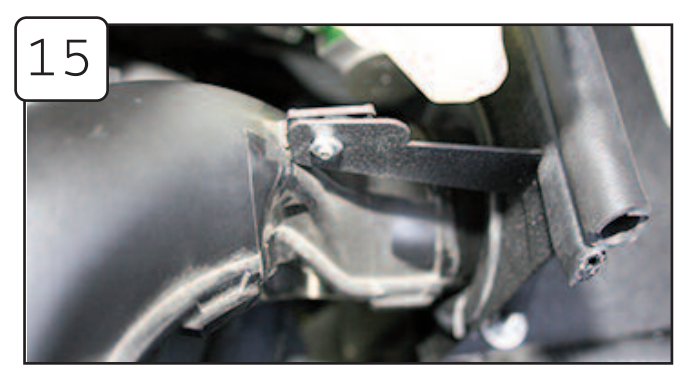
Re-insert stock ram air tube into the opening in the heat sheild. Using the supplied hardware, mount the housing and ram air tube together.