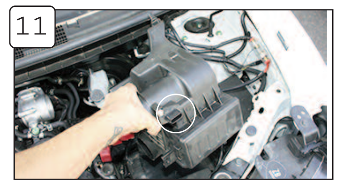
Pull up on the stock intake box and it will come out. After the box is removed, unscrew the MAS sensor and remove it from the stock box. After removing stock air box re-install battery and stock resonator.