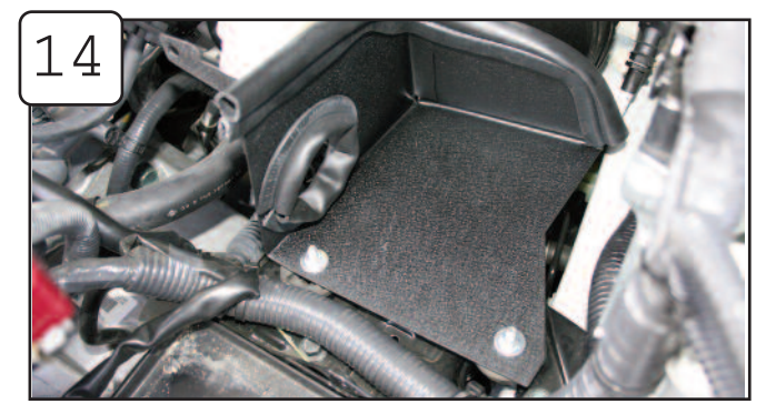
Place housing into the vehicle reusing the stock mounting locations.