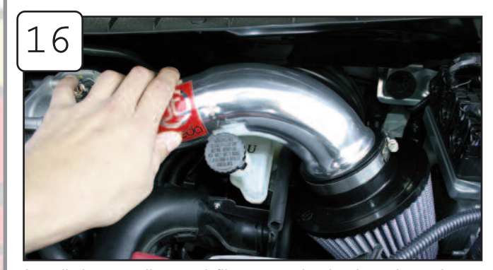
Install the coupling and filter onto the intake tube using a 5/16" nut driver. Position the intake tube into the vehicle making sure to leave clearance from the fluid reservoir. Note: Under acceleration the intake tube will be pulled toward the firewall a inch or two. Leave clearance for this.