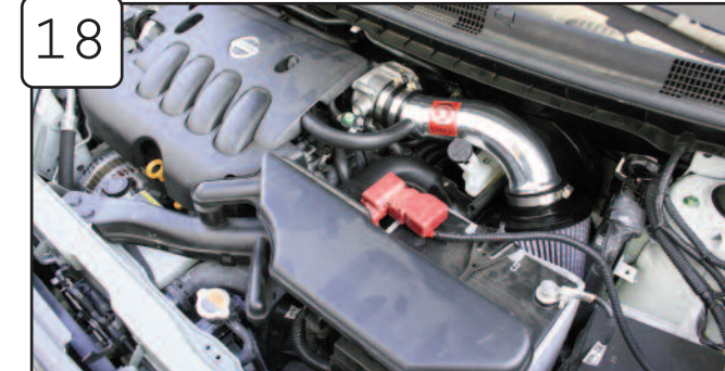
The installation of your Takeda performance intake is now complete.

Place the included CARB EO sticker on or near th intake system on a smooth, clean surface. E.O. i fication label is required in passing the smog cinspection.