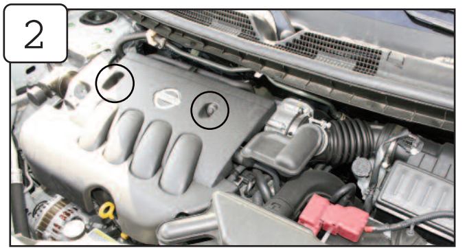
Complete Stock intake. Remove two screws holding the engine cover into place.