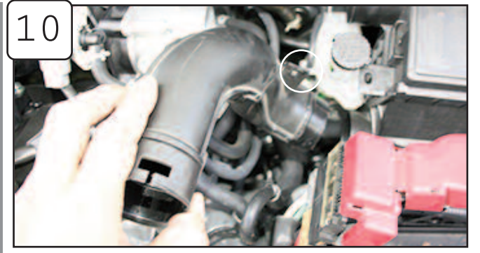
Remove wiring harness attached to stock ram air duct, and pull out the stock ram air duct from the vehicle.