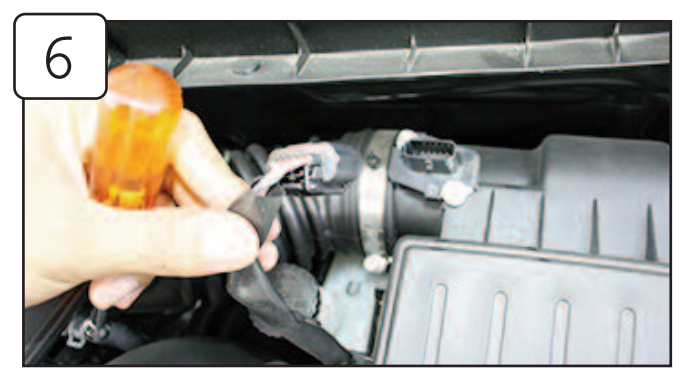
Disconnect the MAS sensor.