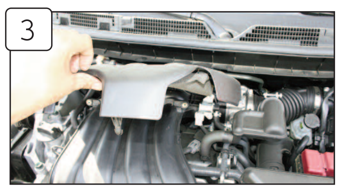
Pull up on the engine cover and remove.