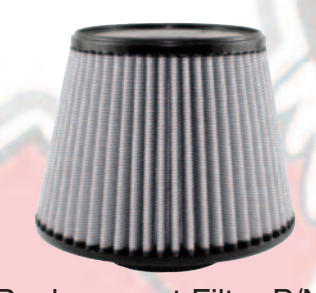
Replacement Filter P/N:

Note: The MAS sensor only reads flow from one direction so it is very important to have the sensor