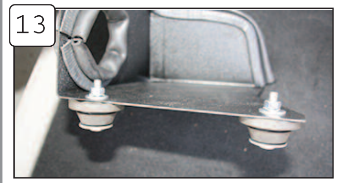
Using the stock rubber mounts that hold the stock air box down, install the following bolts with supplied washers and nuts with spacers as seen in the photo. Note: Make sure spacer is in between grommet to prevent collapsing.