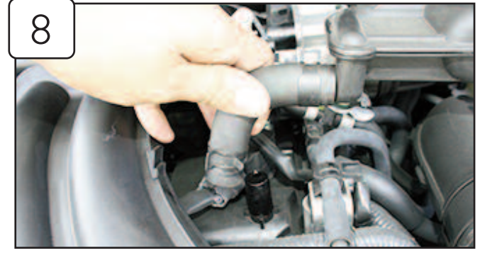
Disconnect the crank case vent line with pliers.