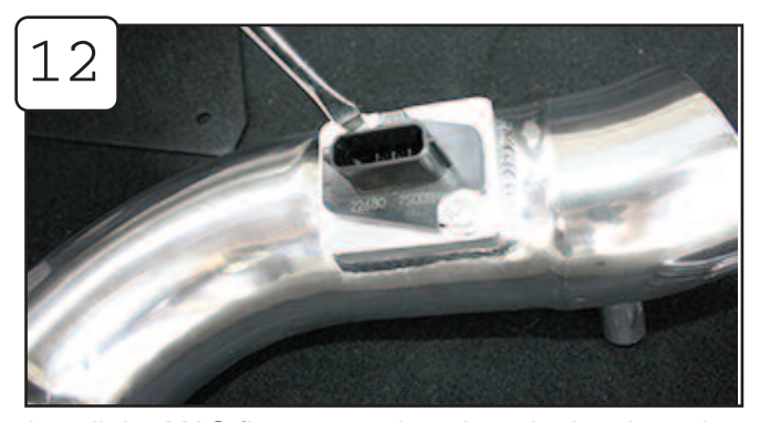
Install the MAS flow sensor into the takeda tube using the supplied screws.

Note: The MAS sensor only reads flow from one direction so it is very important to have the sensor