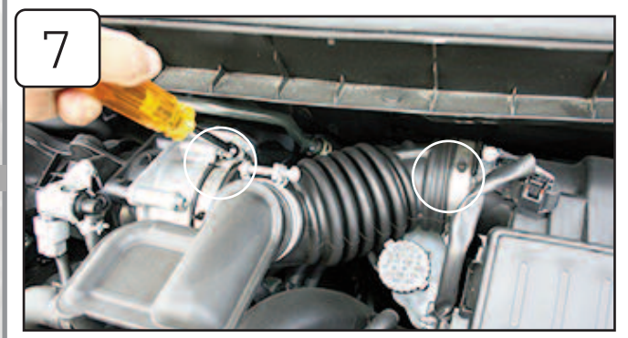
Using a 5/16" nut driver, loosen both intake tube clamps circled.