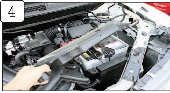
Remove stock resonance chamber.