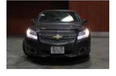
Test all functions before operating the vehicle