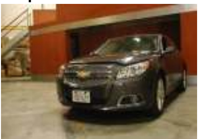
Tools needed: Torx Wrench 7mm Socket Trim Pin Remover