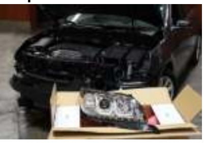
Remove the Anzo headlights from its box