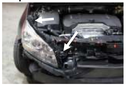
Remove the two 7mm bolts from the top of the headlight housing