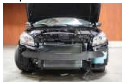
Remove the grille by removing the ten torx screws and four push pins located at the bottom of the grille