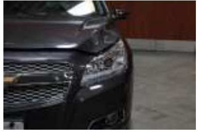
Install the Anzo headlights by reversing the steps 2 to 8