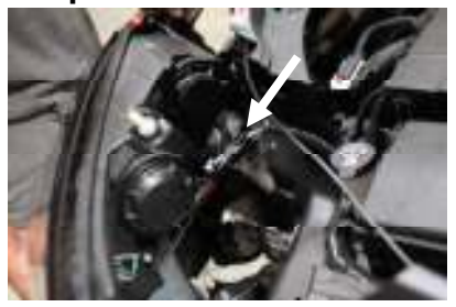
Remove the headlights by unplugging the power source