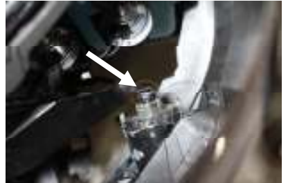
Unplug the power sources from the fog lights