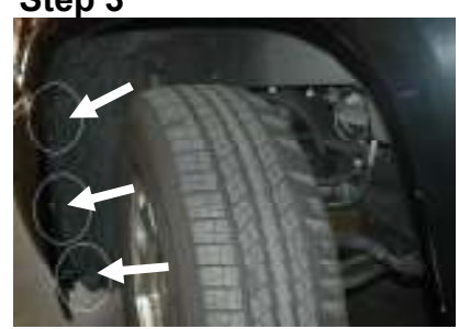
Remove the three torx screws from the side of the wheel well