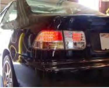
Step 11: Test all functions before driving.