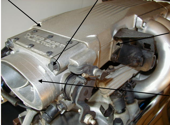
Ref. "C"- (1) Linkage Plate