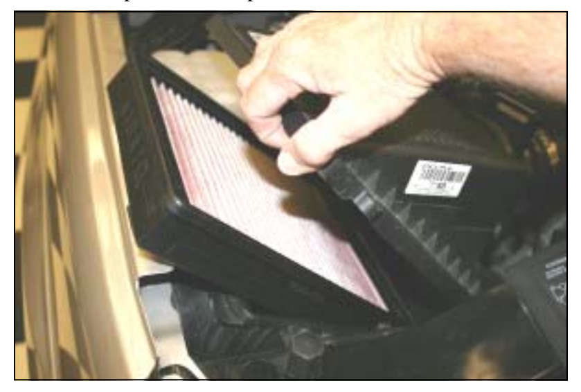
9. Install the Airaid Premium filter into the factory airbox, and re-install the 4 screws.