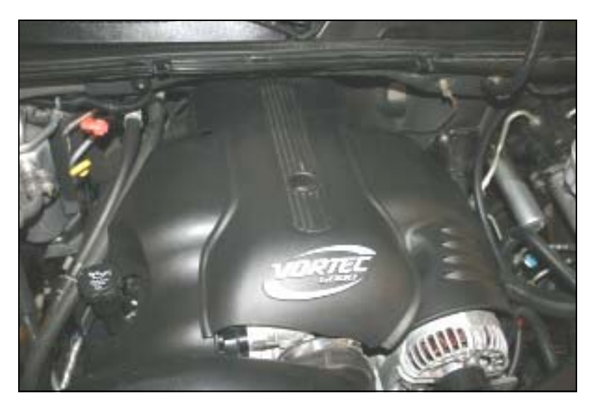
7. Re-install the beauty cover and bolt. If you purchased the 200-919 MIT Kit, skip to step #10. If you purchased the 200-719 Jr. Kit, proceed to step #8.