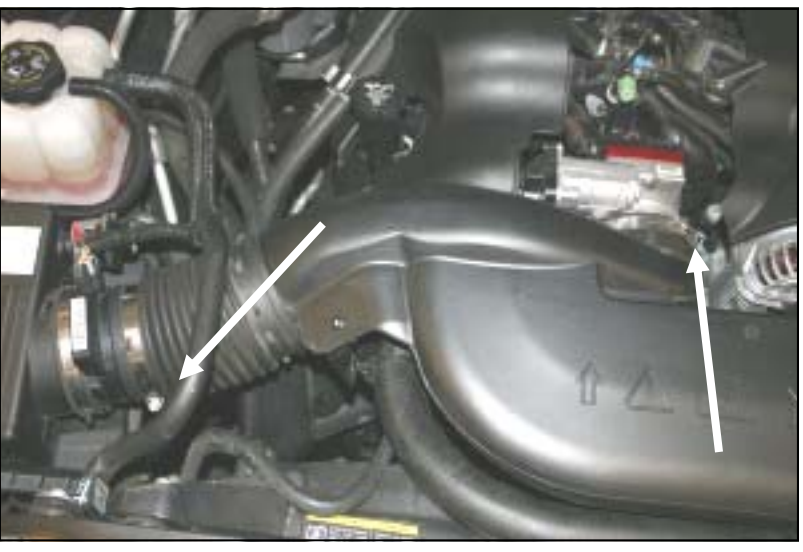
2. Loosen the hose clamps on both ends of the factory intake tube.

1. Disconnect negative battery cable. With a 5/16" socket, remove one bolt on the top of the beauty cover. Set the bolt and the cover aside for re-installation later.