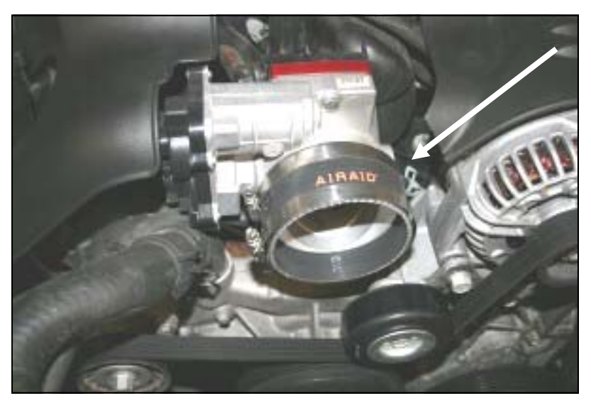
5. Install the coupler (#4) and two #60 hose clamps (#6) on the throttle body as shown. Leave the hose clamps loose for now.