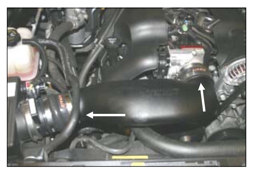
6. Install the Modular Intake Tube (#2) into the hump hose first, and then into the throttle body. Adjust for fit, and tighten all four hose clamps. Re-insert the plastic piece from step #3 into the hole on the bottom of the MIT.