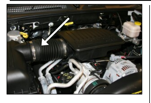
1. .Disconnect negative battery cable. Loosen hose clamp on intake tube at the factory airbox end. For Jr. Kit, replace the factory air filter with the Airaid Premium Filter provided.