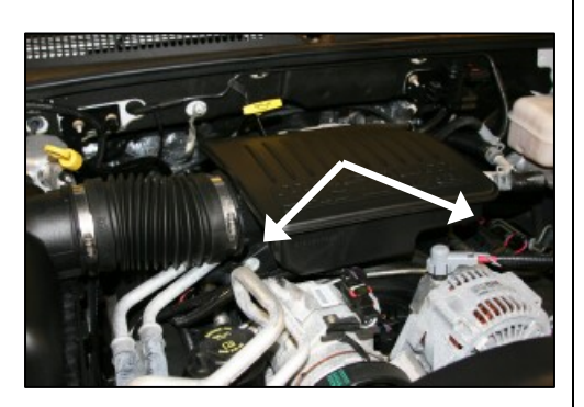
3. With the 10mm socket, remove 2 bolts from the base of the resonator.