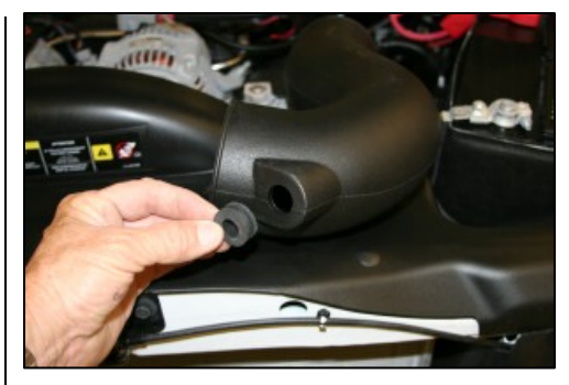
7. Install the grommet into the hole in the MIT as shown.

6. Install the hump hose on the factory airbox with the two #56 hose clamps. (Leave clamps loose.) Next install the reducer (small side first with the #48 hose clamp) on the throttle body. Install the #52 hose clamp on the outside of the reducer, and leave loose.