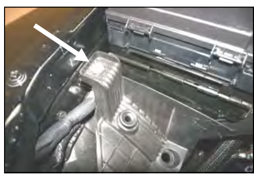
7. With a 10mm socket, remove and save the bolt from the factory plastic air cleaner mount. It will be re-installed in step #12.