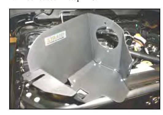
11. Assemble the Cool Air Dam panels (#3 & 4) as shown, using the seven 6-32 screws (#10), flat washers (#11), and keps nuts (#12).