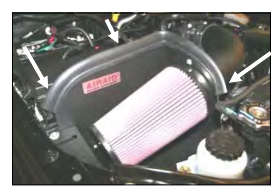
18. Install the Airaid Premium Filter (#1) onto the intake tube, and tighten the clamp. Next install the weatherstrip (#6) onto the top of the CAD as shown.

20. Reconnect the negative battery cable!