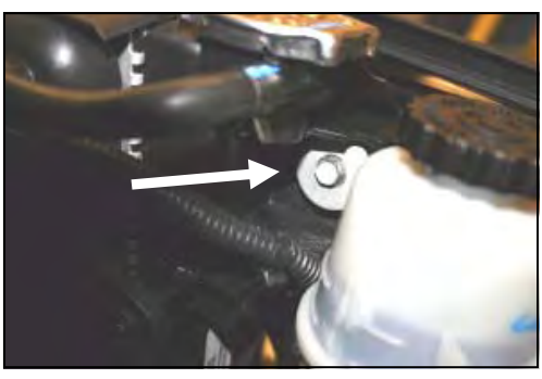
8. With a 10mm socket, remove and save the bolt that holds the radiator to the radiator support. It will be reused in step #10.