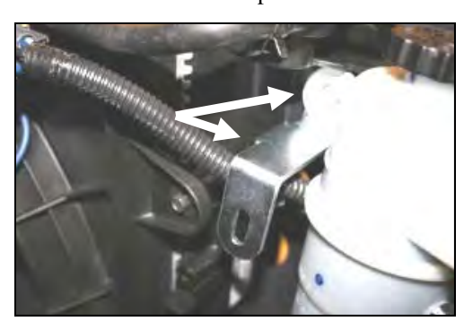
10. Insert the bolt, removed in step #8, thru the round hole in the provided L-bracket, and back into the radiator support. Leave the bolt slightly loose for now.