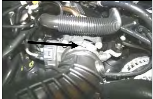
2. Loosen the intake tube hose clamp on the throttle body.