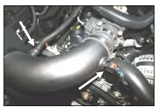
17. Very Carefully reinstall the temperature sensor removed in step #1, into the grommet in the Airaid Intake Tube. Reconnect the factory breather hose to the nipple on the intake tube.