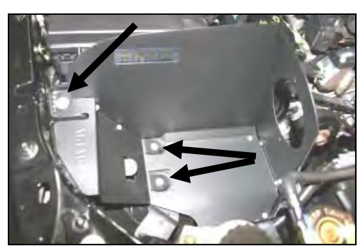
12. Install the CAD into the vehicle. Install the two 3/8x1" button head bolts (#13), thru the bottom panel, and into the well nuts. Reinstall the factory bolt removed in step #7 thru the panel, and into the fender well. Tighten all three bolts at this time.