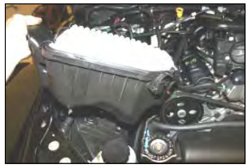
5. While rocking the factory air cleaner base back and forth, pull up, and remove it from the vehicle. There are no bolts holding it down, just grommets.