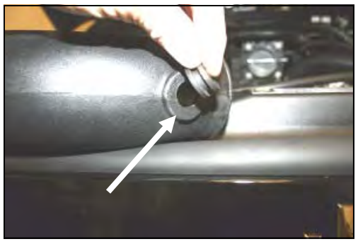
14. Install the supplied grommet (#17) into the Airaid Intake Tube (#2).