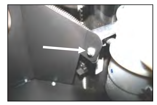
13. Using one 1/4" button head bolt (#7), 1/4" flat washer (#8), and 1/4" serrated nut (#9), attach the CAD panel to the L-bracket, as shown. Now tighten the radiator mounting bolt on the other end of the L-bracket.