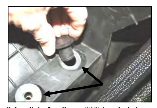
9. Install the 2 well nuts (#18) into the holes in the plastic air cleaner mount where you removed the grommets in step #6.