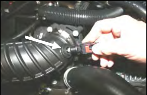
1. <u>Disconnect the negative battery cable.</u> <u>Very Carefully remove the temperature sensor from the factory intake tube by using a circular motion while pulling it straight out. There is no need to disconnect the wiring harness.</u>