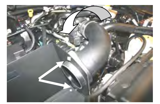
16. Install the Airaid Intake Tube into the hump hose first, and then rotate it down, and into the CAD. Install two 1/4" button head bolts (#7), and 1/4" flat washers (#8) thru the CAD, and into the inserts in the tube. Adjust for fit, and tighten both hose clamps, and bolts.