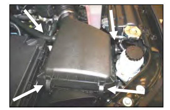
3. Unlatch the 4 metal clips that hold the factory air cleaner lid to the base. Next disconnect the breather hose that attaches to the rear of the air cleaner lid.

5/16", 10mm Socket Ratchet & Extension Phillips Screwdriver 5/32", 7/32" Allen Wrench 7/16" Wrench