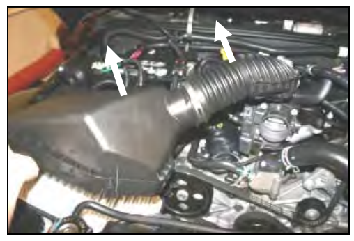
4. Remove the factory intake tube, and lid from the vehicle as an assembly.