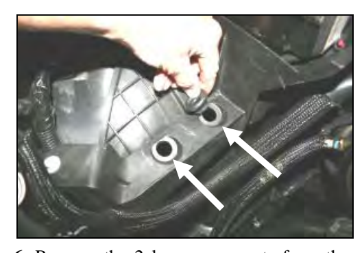
6. Remove the 2 lower grommets from the factory plastic air cleaner mount.