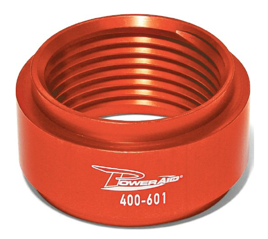
Thank you for selecting AIRAID.

Thank you for purchasing the Poweraid Throttle Body Spacer. Please read the instruction manual carefully before proceeding with the installation. Contact AIRAID @ (800) 498-6951 8:00 AM - 5:00 PM MST Weekdays for questions regarding fit or instructions that are not clear to you. Your Poweraid Throttle Body Spacer was carefully inspected and packaged. Check that no parts are missing, or were damaged during shipping. If any parts are missing, please contact AIRAID.