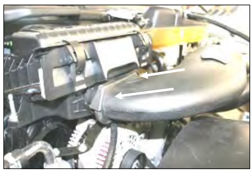
7. Install the Airaid Modular Intake Tube (#2) into the factory airbox. It will "snap" into place.