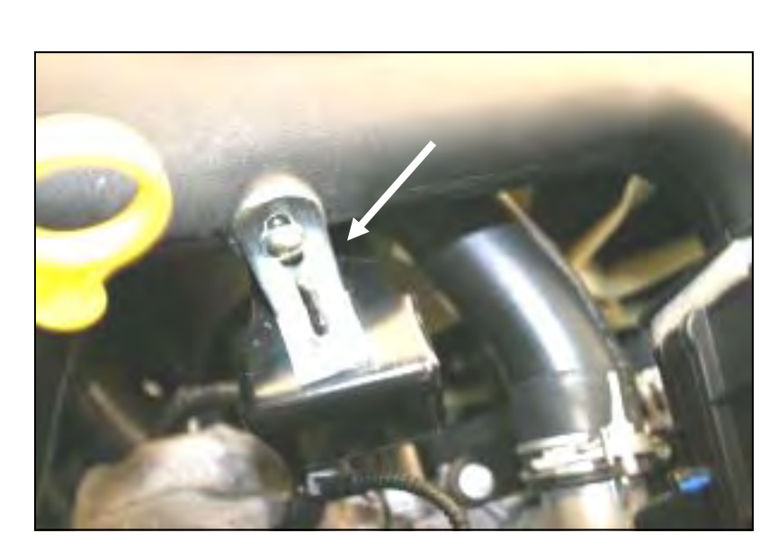
8. Install the L-bracket (#3) over the factory stud re-using the nut removed in step #1. Next install the button head bolt (#4) and washer (#5) thru the L-bracket, and into the tube. Leave loose until final adjustments have been made.