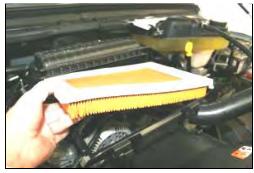
5. Slide the tray out of the factory airbox and remove the factory air cleaner.