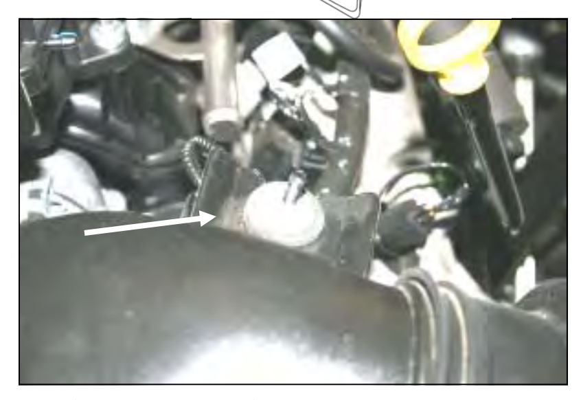
1. <u>Disconnect the negative battery cable.</u> With a 10mm wrench or deep socket, remove the nut from the stud that holds the factory intake tube to the mounting bracket. Save the nut for re-use later in the install.