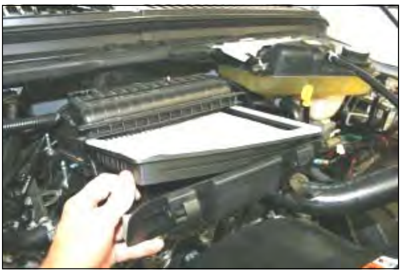
6. Install the Airaid Premium Filter (#1) into the factory airbox tray, slide it back in, and re-latch the two clips.