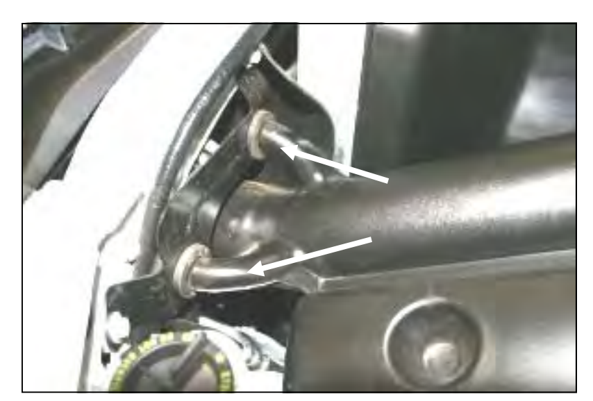
3. Remove the factory tube from the radiator support by pulling the tube out of the grommets. There are no bolts holding the tube. Remove the factory tube from the vehicle.