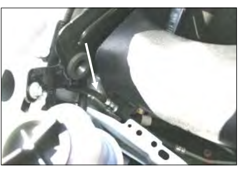
9. Due to inconsistent factory tolerances, some minor adjustment may be necessary to the factory A/C line so it will clear the Airaid MIT near the radiator support.. When all adjustments have been completed, tighten the nut, and button head bolt at the L-bracket.