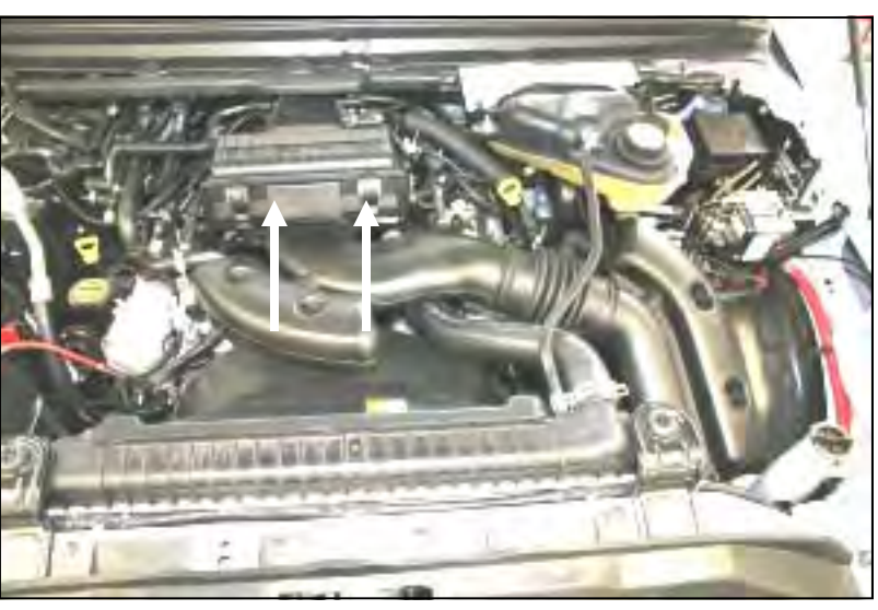
2. Grab the factory intake tube just above the fan shroud, and with a sharp lifting motion, remove it from the air cleaner housing.