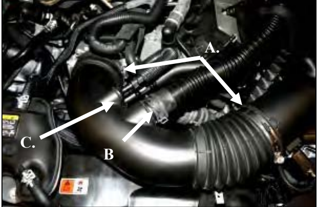
2. A) Loosen the hose clamps on the factory intake tube B ) Squeeze the clamp and disconnect the resonator from the air intake tube. C) Carefully depress the hose lock tabs, and disconnect the crank case breather line and the brake aspirator line (if equipped, AT models only). D) Remove the factory intake tube.