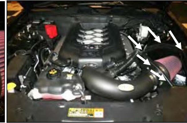
13. Reconnect the Mass Air Flow sensor, which is now 14. Install the Weather Strip (#9) onto the CAB with the located in the lower back side of the intake. Slide the contoured edge going away from the filter. Start at the front of the vehicle and work your way back. Replace the engine cover.