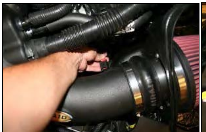
locking tab back into the connector.

shown, and tighten all Hose clamps. A) Reconnect the filter adapter and tighten the hose clamp. B) re install the