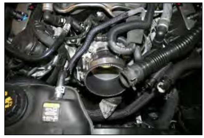
10. Install the Silicone Reducer (#6) and Hose clamps onto the throttle body. Place the #56 clamp (#15) on the Throttle body side of the reducer, and the #64 clamp (#14) on to the tube side.