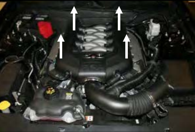
Disconnect The Negative Battery Terminal! 1. Remove the Engine cover by simply lifting up, and set aside.