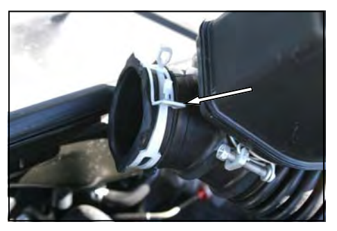
3. Reach down behind the engine with your pliers, and squeeze this clamp, and remove the intake tube from the throttle body.

1. Disconnect the negative battery cable! A). Loosen the hose clamp that holds the factory intake tube to the air cleaner lid. B). Loosen the two bolts that hold the lid of the air cleaner to the base. C). Disconnect the wiring harness from the mass air sensor.