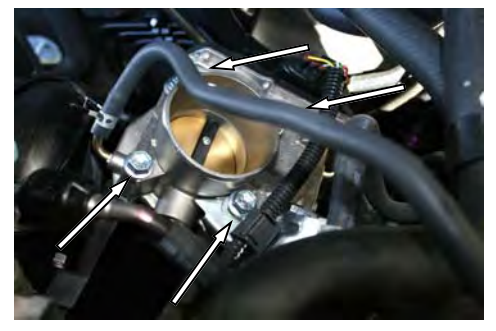
4. Using a 12mm socket, remove four bolts that hold the throttle body to the intake manifold.

2. Carefully remove the lid, turn it over, and pinch the two tabs together to remove the plastic wiring harness holder from the lid (If equipped). Now remove the lid from the vehicle and set it aside, it will be reinstalled later.