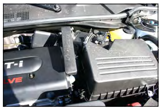
7. Reinstall the intake tube and air cleaner lid. Reconnect the mass air sensor wiring harness, and reinstall the harness holder into the air cleaner lid. Double check your work. Make sure all clamps, bolts, and connectors are tight.