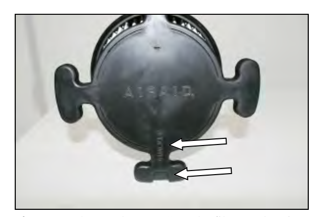
4. Locate the word "Down" on the filter, and notice that there is a notch in the urethane below it. It is important to locate this notch in the correct location in the bottom of the factory airbox.