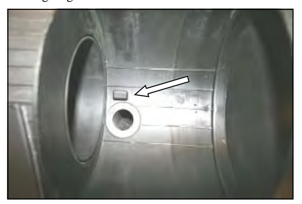
5. Locate the raised rectangle in the bottom of the factory airbox. It is important to engage the notch at the bottom of the Airaid Premium Filter to ensure proper fit and a good seal.

2009-10 Models: Be sure to remove the separate sealing ring with the filter.