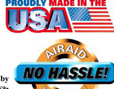
Instructions Revision 10/15/10

Synthamax Air Filters <u>do not</u> require <u>oil</u>. Service air filter as needed by cleaning with common non-petroleum all-purpose household cleaner and water. Simple Green®, Formula 409® or equivalent works great. Apply cleaner to outside of air filter and allow to soak. Then flush filter clean from the inside out with a garden hose and repeat steps if necessary. Do not apply high pressure water or air to clean filter. Allow filter to air dry and reinstall.