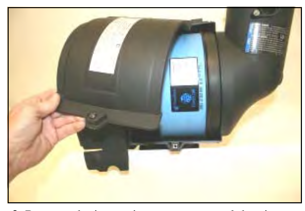
2. Remove the inspection cover to reveal the air filter.