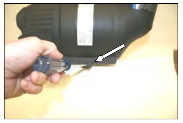
1. Loosen the screw that holds the inspection cover on the top of the factory air box.