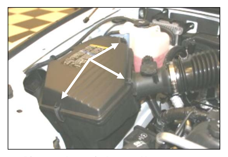
<u>Disconnect the negative battery cable.</u> Unhook the three clips that hold down the air box lid.