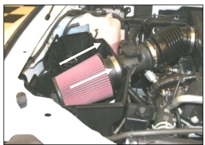
6. Make sure the filter and the hose clamp are pushed close to the factory airbox wall, and tighten the hose clamp as shown. Do Not over tighten.