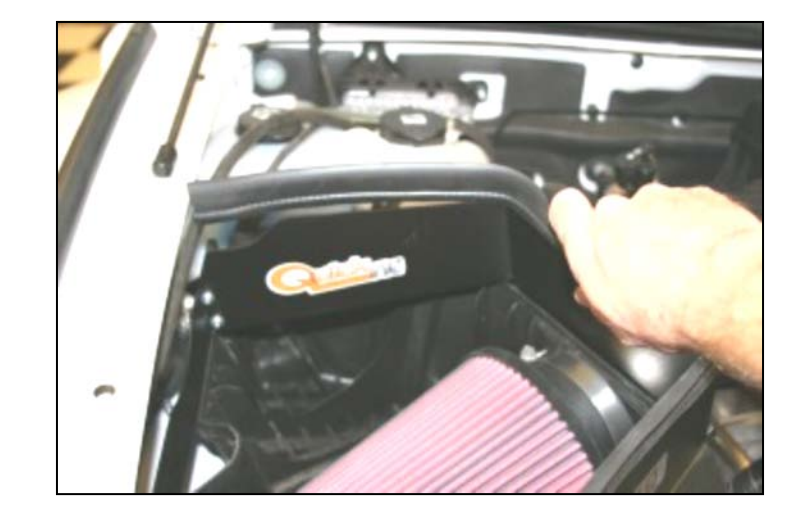
8. Starting at one end of the Quick Fit Panel, install the weather strip (#4) as shown.

B. ) Next, carefully rotate the Quick Fit Panel counterclockwise until the factory clips line up with the tabs on the Quick Fit Panel. Make sure the filter tab retains the Airaid Premium Filter. Using the factory clips, lock down the panel.