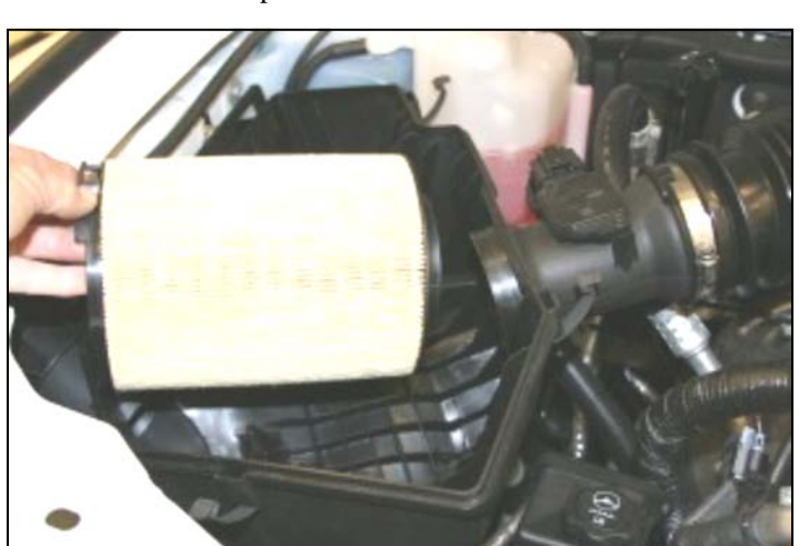
3. Remove the factory air filter from the airbox. Do not remove the factory airbox base. The factory base is required to mount the Airaid Quick Fit Panel.