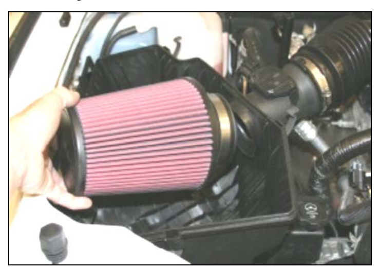
5. Install the Airaid Premium Filter (#1) on the factory intake tube.