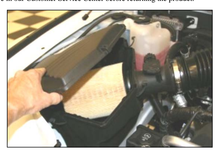
2. Remove the lid by lifting, and sliding it out of the tabs on the side of the airbox.