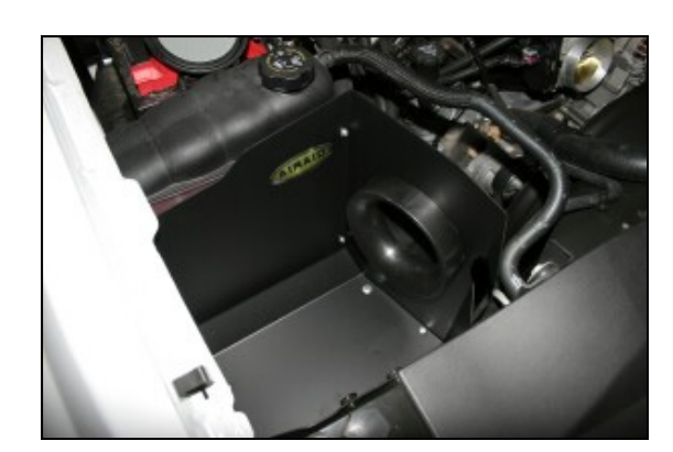
9. Install the Airaid CAD assembly into the vehicle replacing the factory airbox. Secure the CAD using four M6 x 1.25 Hex Bolt (#15), and 1/4" flat washers (#14). Do not over tighten the four bolts.