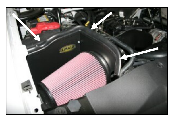
14. Install the Airaid Premium Filter (#1) onto the air filter adapter, and tighten the hose clamp. Next install the provided weather strip (#9) onto the top of the CAD. For ease of install, start at the inner fender, and work your way towards the radiator. Reinstall the beauty cover.