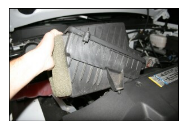
6. Rock the factory airbox back and forth to loosen it from the mounting grommets, and remove it from the vehicle.