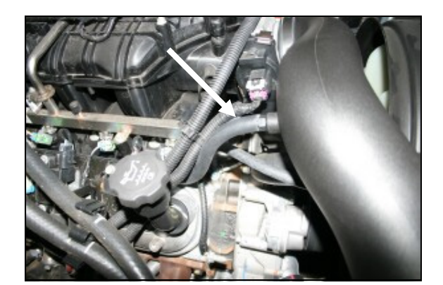
13. Install the 3/8" x 8" breather hose (#8) between the 1/4" NPT x 3/8" barbed fitting in the tube, and the factory port on the valve cover.