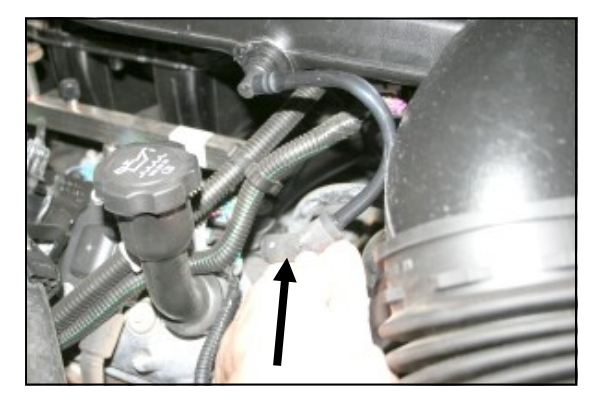
2. Disconnect the factory breather hose at the valve cover.