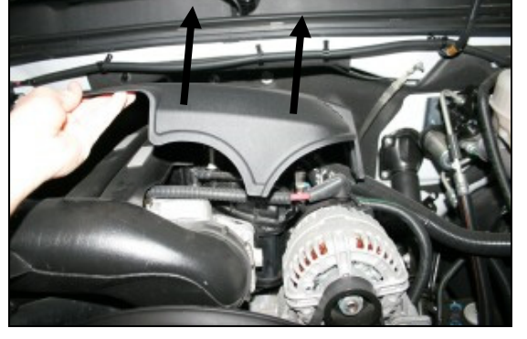
1. <u>Disconnect the negative battery cable.</u> Remove the factory beauty cover by lifting up on the front, and then pulling the cover towards the front of the vehicle. It is only held in place by grommets

If you need any assistance please call 1-800-858-3333 to speak with a representative in our Customer Service Center before returning the product.