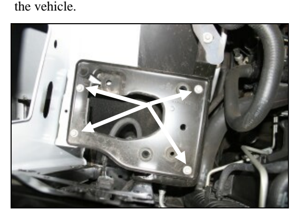
7. Using a 10mm socket, remove four bolts, and then remove the factory airbox mounting plate from the vehicle.