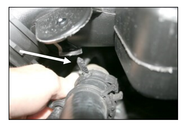
3. Separate the factory intake tube from the plastic clamp that secures the radiator hose to the tube. A firm downward push will usually do it.