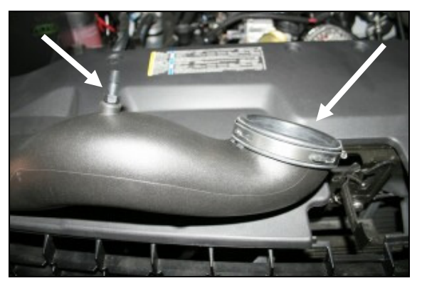
11. Install the 1/4" NPT x 3/8" Barb Fitting (#17) into the Airaid Intake Tube as shown. Next install the supplied coupler and hose clamp (#7) onto the throttle body end of the tube. Leave the clamp loose for now.