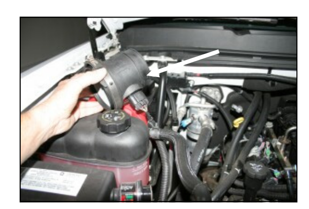
5. Remove, and set aside the MAF (Mass Air Flow) sensor from the factory airbox using caution to retain the factory clamp and seal.