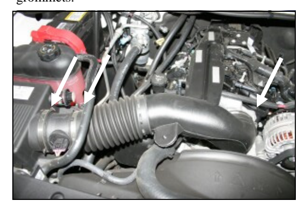
4. Loosen three hose clamps. One at each end of the factory intake tube, and one on the Mass Air Flow sensor (MAF) where it clamps to the factory airbox. Remove the factory intake tube from