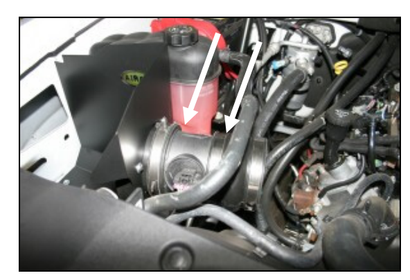
10. Reinstall the MAF sensor onto the filter adapter, and tighten the clamp. Next install the urethane hump hose (#6) onto the MAF with the two #64 hose clamps (#16). Tighten only the hose clamp that secures it to the MAF .