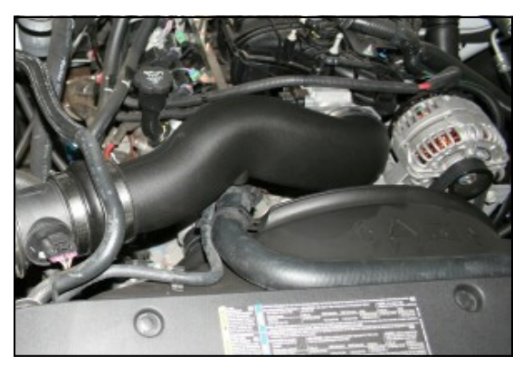
12. Install the Airaid Intake Tube into the hump hose first, and then onto the throttle body. Adjust it for fit, and then tighten the hose clamps.