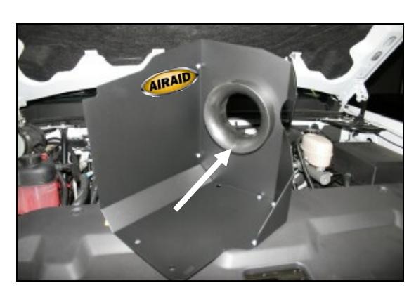
8. Assemble the Cool Air Dam panels (CAD) (#2 & #3) using five 6-32 x 5/16" screws (#10), #6 flat washers (#11), and 6-32 keps nuts (#12). Next install the air filter adapter (#5) into the panels as shown using three 1/4 - 20 x 1/2" button head bolts (#13), and 1/4" flat washers (#14). Apply the Airaid Foil Decal onto the Panel as shown.