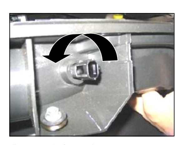
7. Remove the factory air temperature sensor from the resonator by turning it counter clockwise and pulling it straight out (save for reuse).