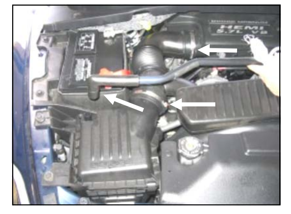
1. <u>Disconnect the negative battery cable.</u> Remove the valve cover breather hose from the factory air box lid. Loosen the hose clamps on both sides of the factory intake tube.