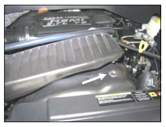
2. Unsnap the factory intake tube baffle from the fan shroud and then remove the factory intake tube assembly from the vehicle.