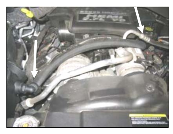
12. Remove the factory breather hose. Connect one end of the <sup>3</sup>/<sub>4</sub>" x 25" hose (#5) to the nylon fitting and the other to the oil fill nipple as shown. Secure each end using one #24 Speed Clamp (#16). Adjust the nylon fitting downward to clear the Airaid Intake Tube assembly.