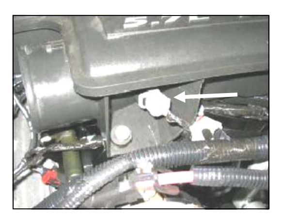
5. Carefully disconnect the factory air temperature sensor wiring harness from the sensor in the resonator.