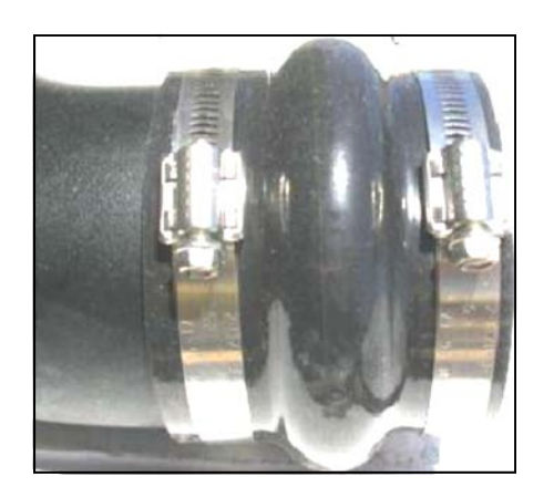
14. Install the hump hose (#7) and coupler (#8) onto the Airaid Intake Tube using four #60 hose clamps (#18). The coupler is positioned on the throttle body end and the hump hose is positioned on the air filter adapter end of the tube.