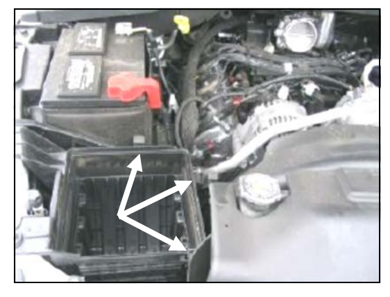
3. Unlatch the clips that secure the air box lid to the air box base, and remove the air box lid from the vehicle. Using a 13mm socket, remove the air box base from the engine compartment.