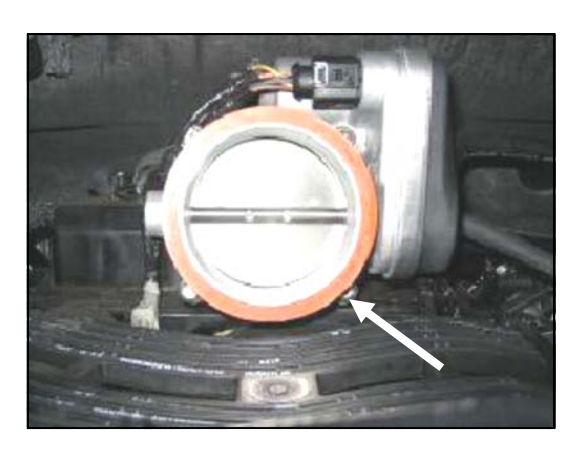
8. Remove the factory orange seal from the throttle body.