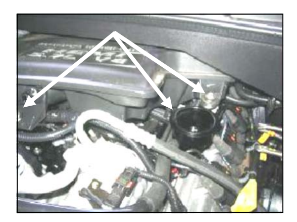
6. Remove the oil fill cap from the valve cover. Using a 10mm socket, loosen the two factory resonator bolts. Remove the resonator from the engine and then replace the oil fill cap.