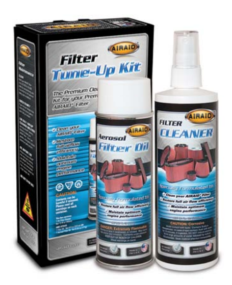
P/N 790-551 Aerosol Spray P/N 790-550 Squeeze Spray