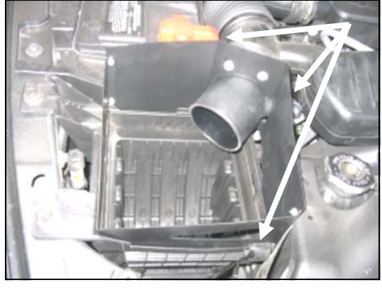
11. Install the Quick Fit Panels onto the top of the factory air box base. Relatch the factory clips onto the tabs on the Quick Fit Panels.