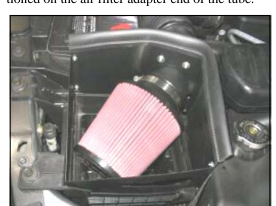
17. Install the Airaid Premium Filter (#1) onto the end of the air filter adapter. Install the weather strip (#9) onto the top of the Airaid Quick Fit Panels. ( Note: start from one end and work your way around to insure proper alignment of the weather strip. )