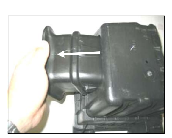
4. Using a flat blade screwdriver, carefully unsnap the air box base inlet from the air box base and remove it. Reinstall the factory air box base into the engine compartment without the inlet.