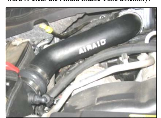
15. Install the Airaid Intake Tube assembly onto the engine with the hump hose end towards the air filter adapter. Adjust the assembly for fit and then tighten the four hose clamps.