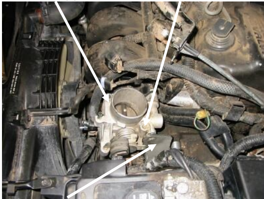
Ref. "B"- (1) Special Bracket