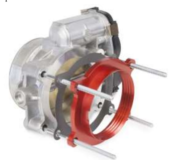
Example of proper spacer installation. Spacer must protrude into intake manifold and away from throttle body.