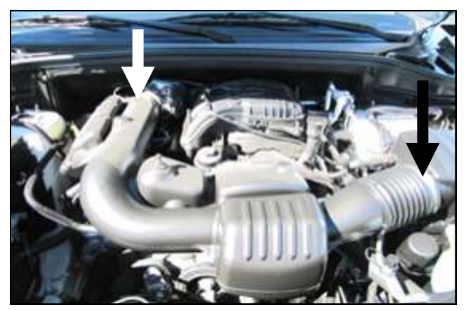
3. Loosen the clamps on both ends of the intake tube, and remove from the engine compartment.