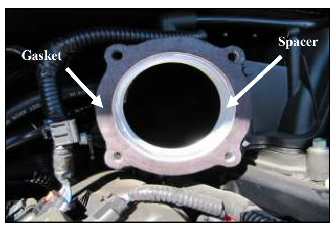
5. Insert the Airaid spacer into the intake manifold. The gasket will go between the spacer and the throttle body. *Note: Airaid spacer must be installed with bore protruding into intake manifold away from throttle body. Incorrect installation will hinder performance. Reference picture below for spacer orientation.