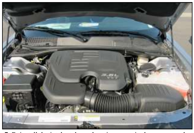
7. Reinstall the intake tube and engine cover in the reverse order that they were removed. Make sure to reconnect the temperature sensor.