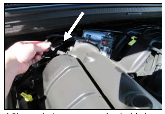
2. Disconnect the air temperature sensor from the air intake tube, just forward of the throttle body.

Lift up on the engine cover to unseat it from it's mounting grommets, remove it from the vehicle, and set aside.